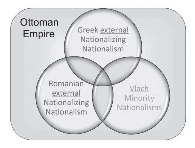
Fig. 3. Brubaker's analytical model, applied to the so-called 'Aromanian Ouestion'

a Romanian external nationalizing nationalism, a Greek external nationalizing nationalism (both being deployed in Ottoman Macedonia), and two Aromanian minority nationalisms (one pro-Greek, one pro-Romanian). As shown in the following figure: