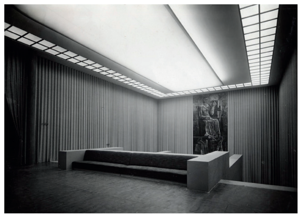
3. Anonymous, Giuseppe Pagano's presentation of Mario Sironi's mosaic Fascist Labor (1936), 1936, photograph, VI Triennale di Milano , Palazzo dell' Arte.

gory of enthroned Italy left no doubt about its significance as a quasi-Christian revelation of labor as the redeemer for Italy's fascist nation.<sup>22</sup> Pagano's display alone conveyed "the impression that the glorious days of Italian art and culture – Roman Antiquity – was poised for its imminent rebirth."<sup>23</sup> Exhibition design in Fascist Italy, I argue, not only had to mediate between art and architecture, but also had to bridge the present with the past even beyond the degree to which all exhibitions try to turn history into present experiences and events.