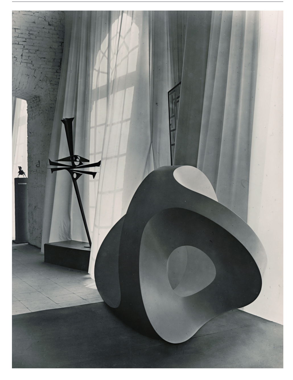
7. Erich Müller, Installation view of Max Bill's Konstruktion (1937) on a black pedestal with Hans Uhlmann's Stahlplastik (1955) in the back and Theo van Doesburg's Rhythm of a Russian Dance (1918) on the right between white, billowing Göppinger Plastics©, 1955, photograph, documenta , Fridericianum, Kassel, © documenta archiv