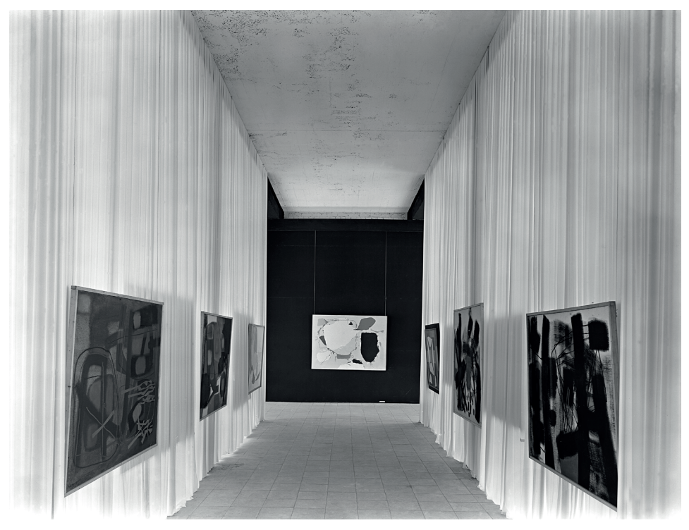
9. Günther Becker, Installation view with Willi Baumeister's Monturi mit Rot und Blau (1953) in the center and paintings by other contemporary German artists, 1955, photograph, documenta , Fridericianum, Kassel, © documenta archiv

or on the framed canvases hung directly on the rippling white or black wall hangings. The curtains sometimes covered brick walls, while at other times they were used as partitions to provide a translucent form of separation between spaces (ill. 9). Intermittently, visitors could even see the shadows of the paintings in the adjacent section.