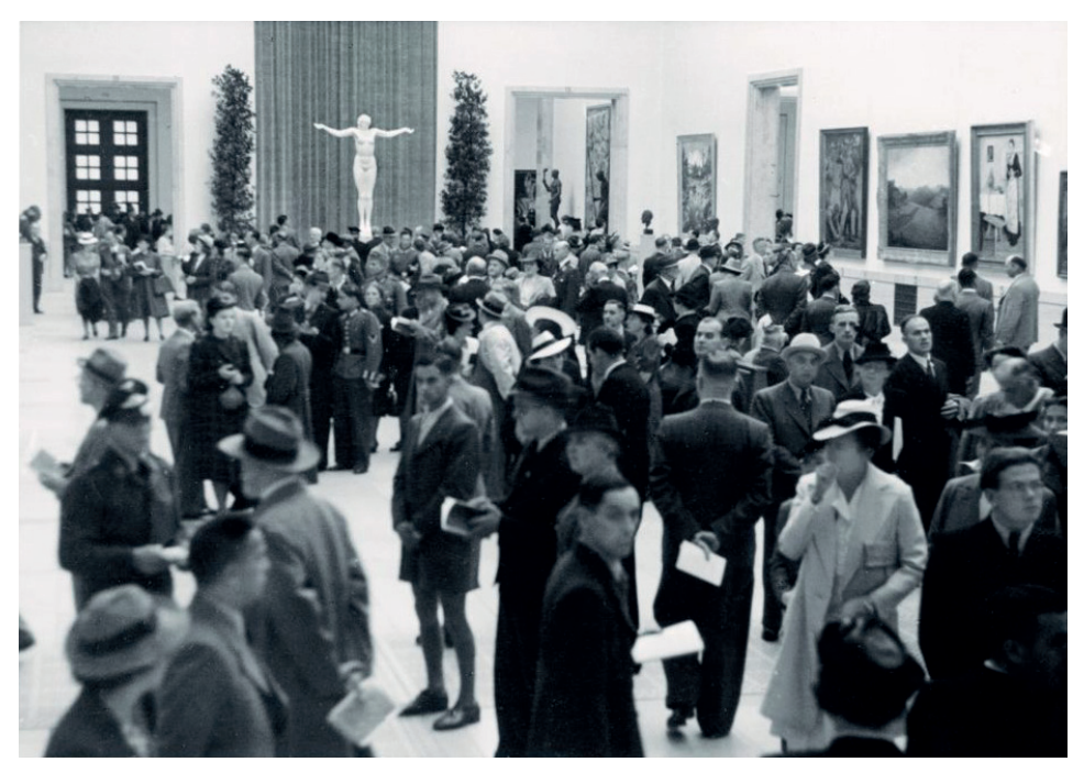
4. Anonymous, Installation view with Josef Thorak's sculpture Female Nude (1940) in the background, 1940, photograph, Grosse Deutsche Kunstausstellung , Haus der Kunst, Munich. © Zentralinstitut für Kunstgeschichte, Photothek

The example of the state-sanctioned exhibition design, however, demonstrates that the rationalist-neoclassicist architecture and overbearing white wall-space in Munich's House of German Art forced the exhibition designers,