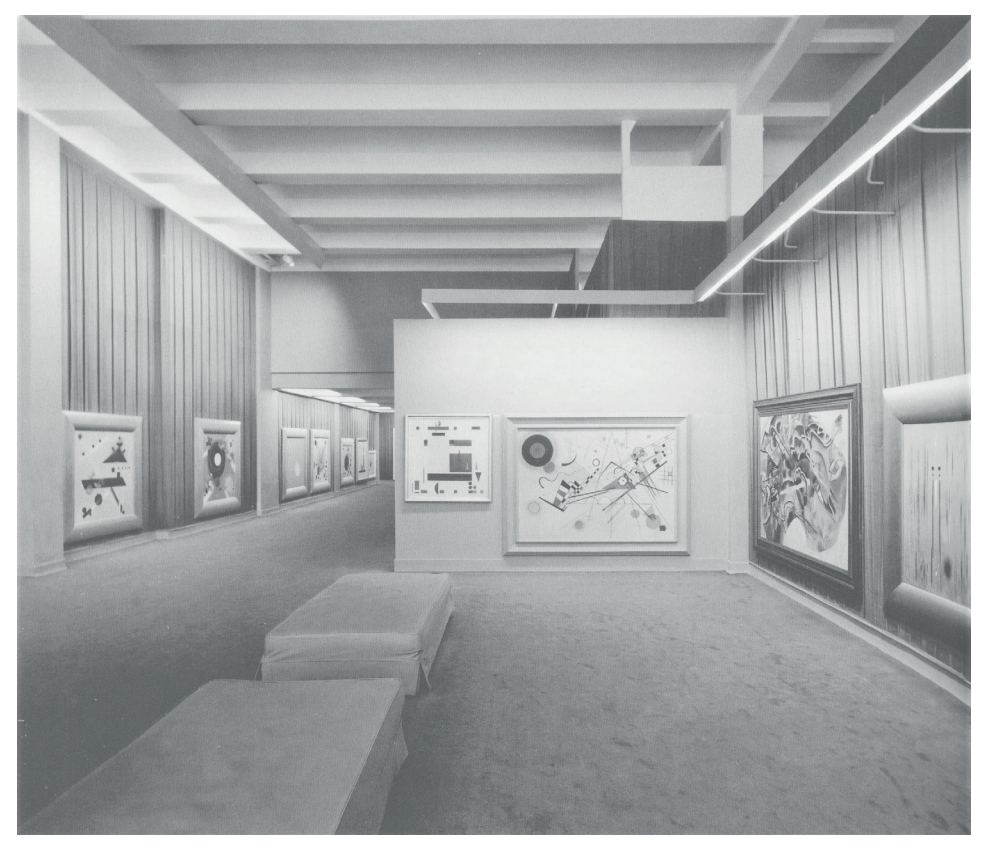
2. Anonymous, Installation view with paintings by Rudolf Bauer and Wassily Kandinsky, 1939–40, photograph, Art of Tomorrow , Museum of Non-Objective Painting, 24 East Fifty-forth Street, New York.

regeneration and wellbeing: to provide the visitor with instructions for finding balance. This aim signaled the departure from the institution's educational mission and instead arrived at a quasi-religious "Temple of Non-Objectivity and Devotion."<sup>12</sup> "Joy," Rebay praised hymn-like, "is what these masterpieces in their quiet absolute purity can bring to all those who learn to feel their unearthly donation of rest, elevation, rhythm, balance, and beauty."<sup>13</sup> Photo-