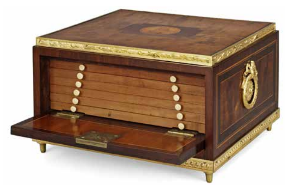
4. Georg Haupt, medal cabinet, 1780, birch, amaranth, boxwood and gilded brass, 30.5 \times 28.5 \times 18.5 \text{ cm} , Lot. 800, 90001, Bukowskis

Ehrenpreus's cabinet was very grand and required a designated space. Coin cabinets could also come in smaller, more convenient sizes, like the one gifted to the Duke of Oldenburg, Peter I (1719–1829), by his cousin, the