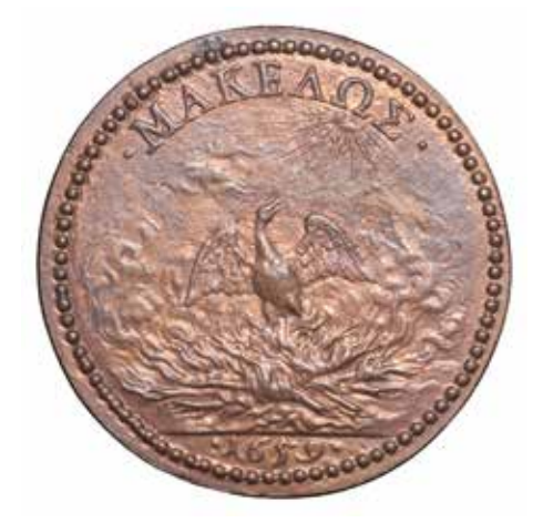
8. Alberto Hamerani, Christina as Phoenix , 1659, cast bronze, Ø 41.98 mm, 32.11 g, Hd. 103, inv. 201657, alvin-record: 76490, UUCC