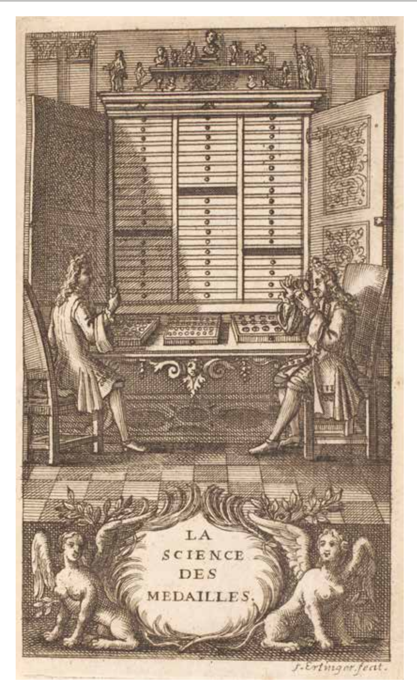
9. Franz Ertinger, Louis Jobert La Science des medailles , Paris: de Bure 1739, engraving [1710], Bayrische Staatsbibliothek, München