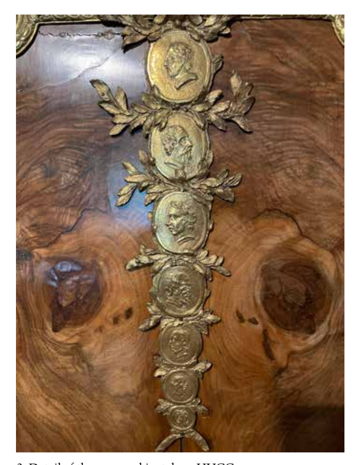
3. Detail of the upper cabinet door, UUCC

had carved-out holes to hold coins and medals. The holes would prevent the objects from scraping against each other and rattling around while the drawer was being opened or closed. Another reason was to organise the cabinet's contents. The insides of each drawer could be arranged in whatever way suited the collector; by regents, chronological, geographical, by type of currency, or even by metal. Susan Pearce notes that objects in a collection are entwined in relationships with each other. <sup>41</sup> Each coin or medal could be appraised individually, each had a value and physical characteristic of its own, but it also held a purpose within the collection. It was or would be part of a group. Simply put, by organising the