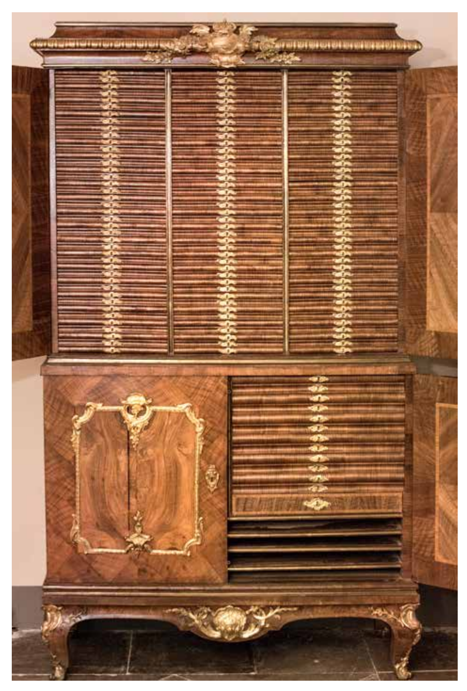
2. Cabinet of the Chancellor of Uppsala University Count Carl Didrik Ehrenpreus (1692–1760), Uppsala University Coin Cabinet [UUCC]