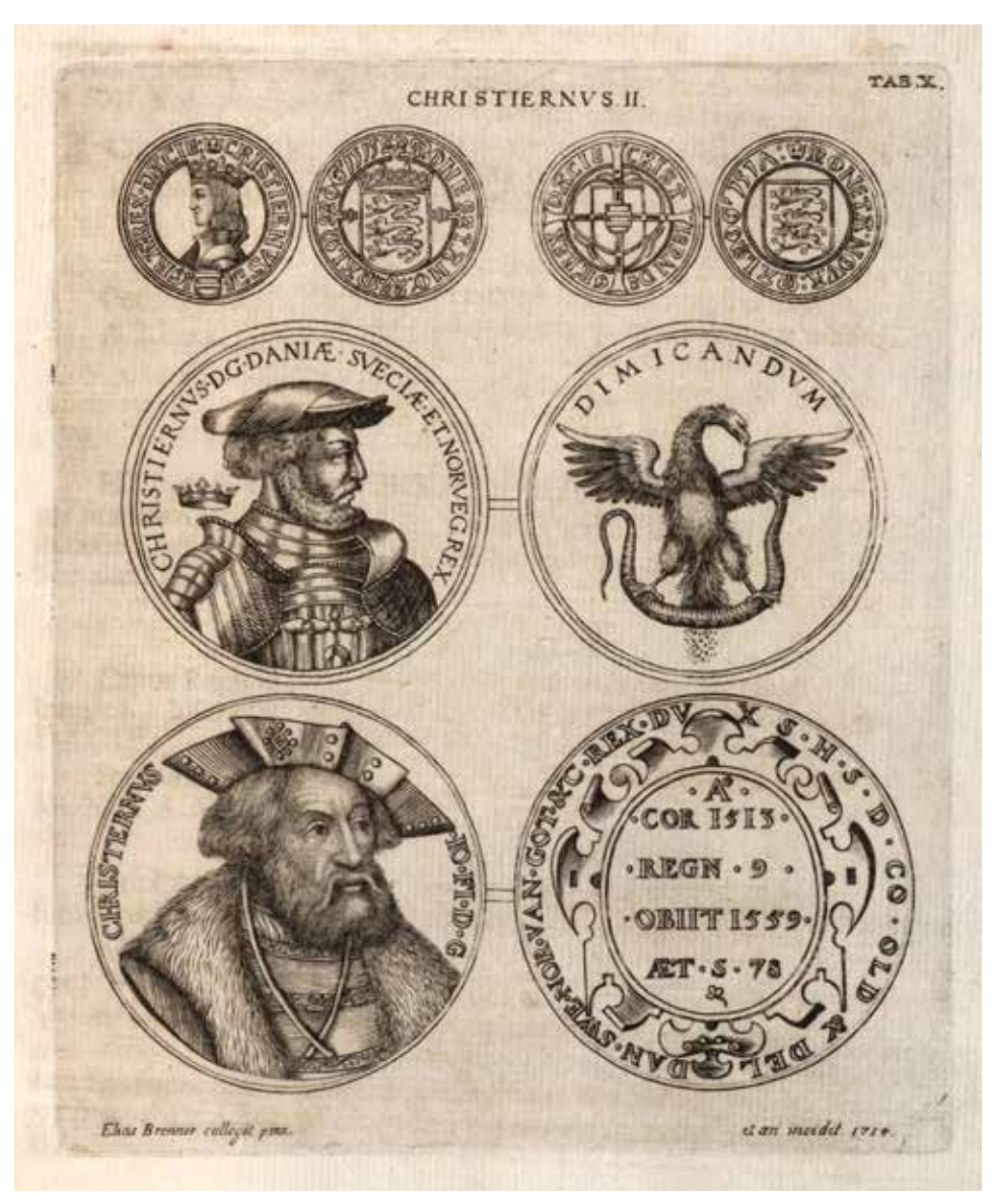
5. Erich Reitz, Willem Swidde (?), Elias Brenner, Thesaurus nummorum sueo-gothicorum [...] 1731, tab X, engraving, alvin:record: 175815, UUB