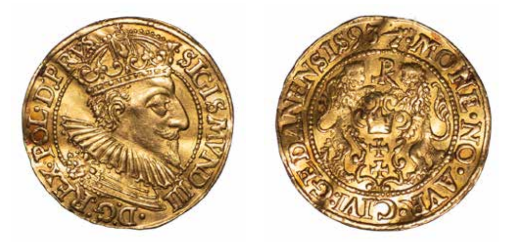
10. Sigismund III of Vasa, 1 ducat 1593, gold, 22 mm, 3,50 g, ID:2567, alvin-record: 353484, UUCC

was minted shortly before Sigismund III, who in addition to being King of Poland, also was crowned King of Sweden. The coin measures about 22 mm in diameter, a size which would require the beholder to lay it in their palm or secure it with thumb and index finger to turn it and scrutinise its surface and identify the image stamped into the metal. The obverse depicts the king seen from the right (ill. 10). 61 He wears a crown, a ruff, and a cuirass adorned with a lion's head on his shoulder. His portrait is encircled by the inscription SIGISMVND.III.D:G:REX.POL.D:PRVS. [Sigismund III, by God's grace king of Poland and Prussia. The reverse shows the coat of arms of the city of Gdańsk, a crown above two crosses supported by two lions. Between the lions' heads, one can spot the chi rho symbol \( \mathbb{P} \). The legend reads MONE.NO.AVR. CIVI:GEDANENSIS93. [new gold coin minted by the city of Gdańsk]. The coin and Sigismund III, who once minted it, might spark a conversation about long-gone political affairs and fierce conflicts, and perhaps even inspire discussions about religion, as Sigismund III's Catholic confession was used as a main argument by Karl IX to undermine his nephews' suitability to rule Lutheran Sweden. 62 It is, of course, impossible to know how Ehrenpreus handled his collection and conversed about it with his guests, but it remains without a doubt that the rich context surrounding the numismatic objects invited social interaction.