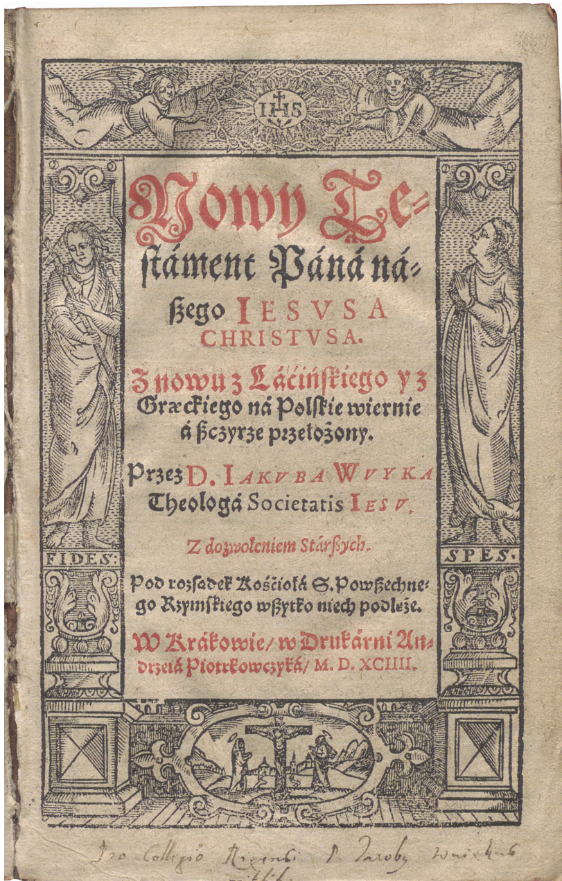
Figure 1. Nowy Testament Pána nášego Iesvsa Christvsa , Kraków: Piotrkowczyk Andrzej, 1594. On the title page inscription Pro Collegio Rigensi D. Jacobus Wujekus mittit – J. Wujek is sending the book to the Riga Jesuit College library. Uppsala University Library, Riga 111 (UB 55:92)