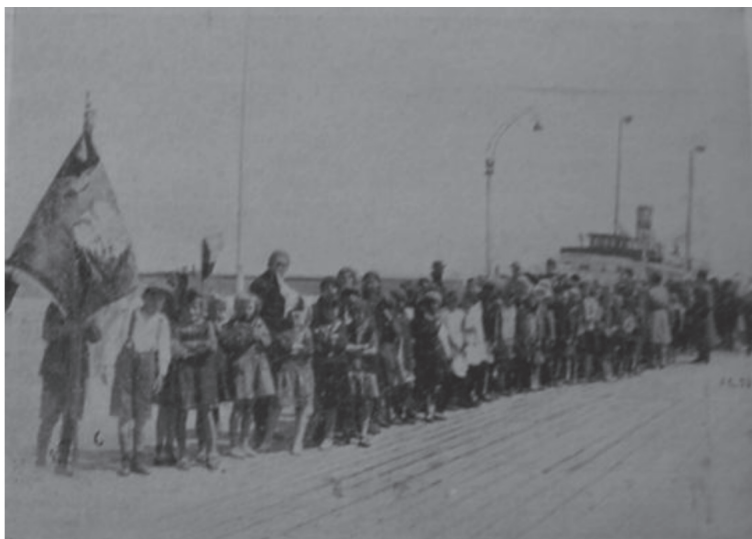
Fig. 7. Children on the Sopot Pier