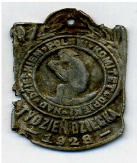
Fig. 2. Medal from the “Children’s Week”, 1928

The executory section of the “Children’s Week” sold honorary badges, window stickers or stamps especially prepared for the “Children’s Week”. It also organised local fund-raising in public establishments and private apartments, events of a profit-oriented character as well as negotiated discount sales at commercial and industrial companies 32 . Whereas, the Audit Committee controlled the activity conducted by the executory section and approved accounting statements from Voivodeship committees 33 .