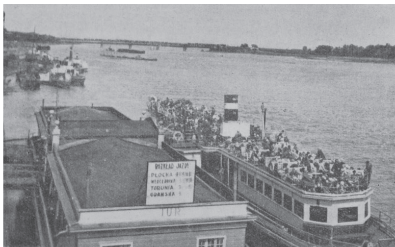
Fig. 6. Cruise on the Vistula River organised in the Children's Week, Warsaw 1930 Source: "Childcare" ("Opieka nad Dzieckiem") 1930, no. 6, p. 315