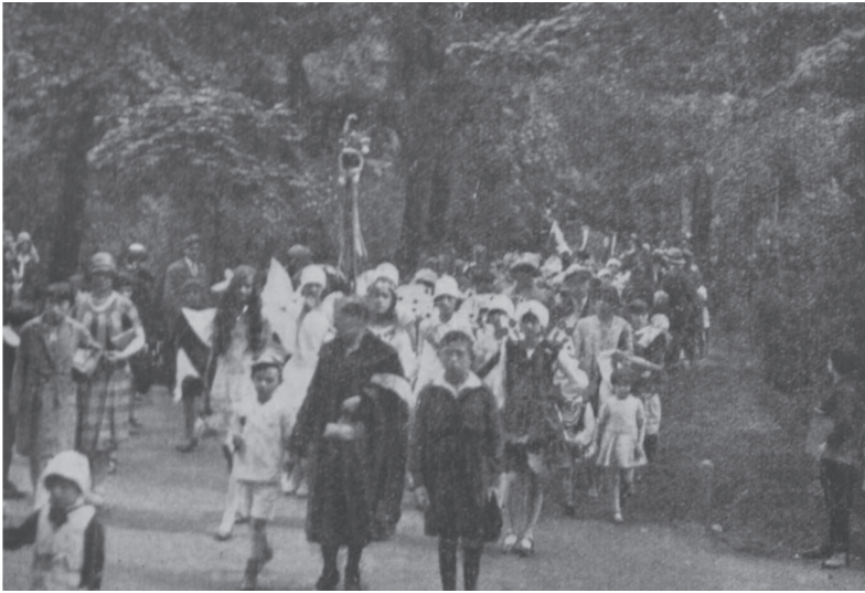
Fig. 4. Children's march in the Saxon Garden, in Warsaw, 1930

to pass time having fun 38 . After finishing the march at the previously chosen spot, there was a short rest time. Then, children were served a meal consisting of sweet bread, lemonade, milk and sweets and other treats 39 . When the rest time ended and the meal was eaten, children went to theatres and cinemas where they had another attractions in a form of various performances waiting for them. However, those were not random plays. Plays presented to children were happy and cheerful due to the character of the holiday. Participation in initiatives and the possibility to see the performance were surely an unusual attraction giving a lot of joy to many children.