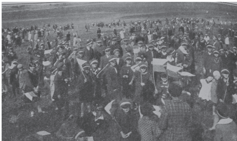
Fig. 3. Children during the march on the Children's Day, carrying white and green flags

various attractions was to significantly differ from the everyday reality. During a joyful and full of unforgettable experiences and attractions day no child should stop smiling irrespectively of its difficult situation 35 .