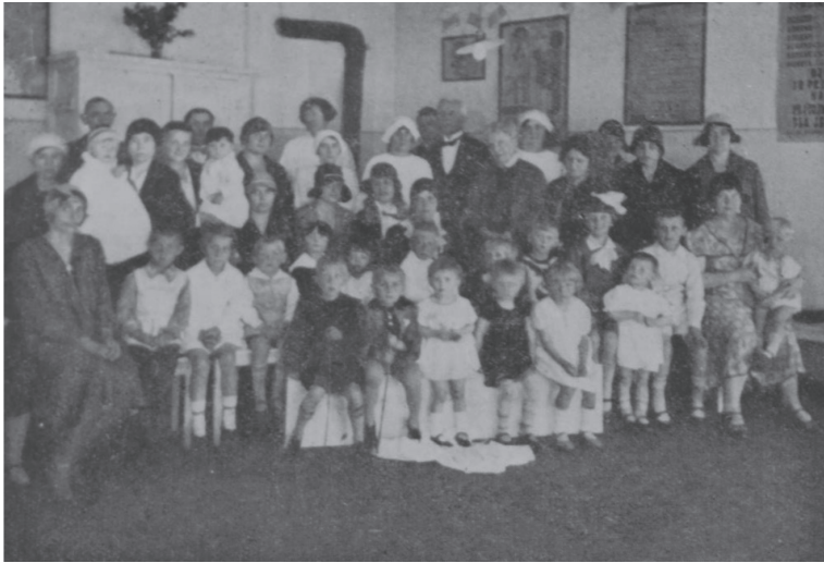
Fig. 8. Mothers awarded in 1929 on the occasion of the “Children’s Week” in the Station for Care of the Child (Stacja Opieki nad Dzieckiem) of the PCC, Warsaw ul. Podwale 50 Source: “Childcare” (“Opieka nad Dzieckiem”) 1930, no. 6, p. 315

present on the Holiday. Pre-schoolers prepared an artistic part for their mums – they recited poems, sang songs and danced. Each mother received from her child flowers and a booklet entitled: To Mother! (Tobie Matko!) 53 . The pedagogues made occasional speeches. The Mother’s Holiday also comprised an occasion for parents to learn about the year’s work of their children, which was presented at local exhibitions especially prepared for this purpose 54 . Furthermore, the Mother’s Day was an occasion for the PCC to award mothers with a model conduct, who contributed to the Committee’s social actions.