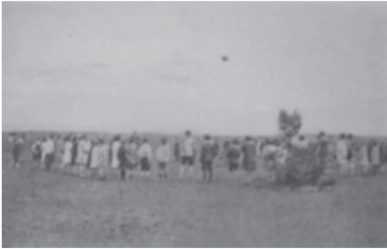
Fig. 5. Children from Warsaw school no. 197 during football match on the Children's Day Source: "Childcare" ("Opieka nad Dzieckiem") 1930, no. 7, p. 351

carried colourful flags just like their older colleagues. Upon arrival, hosts and guests eat dinner together and passed time on joyful games. At the end of the day each child was given a sweet gift in a form of candies. In Warsaw, in 1930, pre-schoolers, who did not participate in the march, passed time in compliance with the plan prepared by the school inspectorate in one of the city parks: Jordanowski, Ujazdowski, Traugutta, Saski, Skaryszewski etc. Children were playing in parks to the accompaniment of military or police orchestras. Numerous attractions included, among others: a cruise on the Vistula River, performances in cinemas, gymnastics shows in Agrykola 40 .