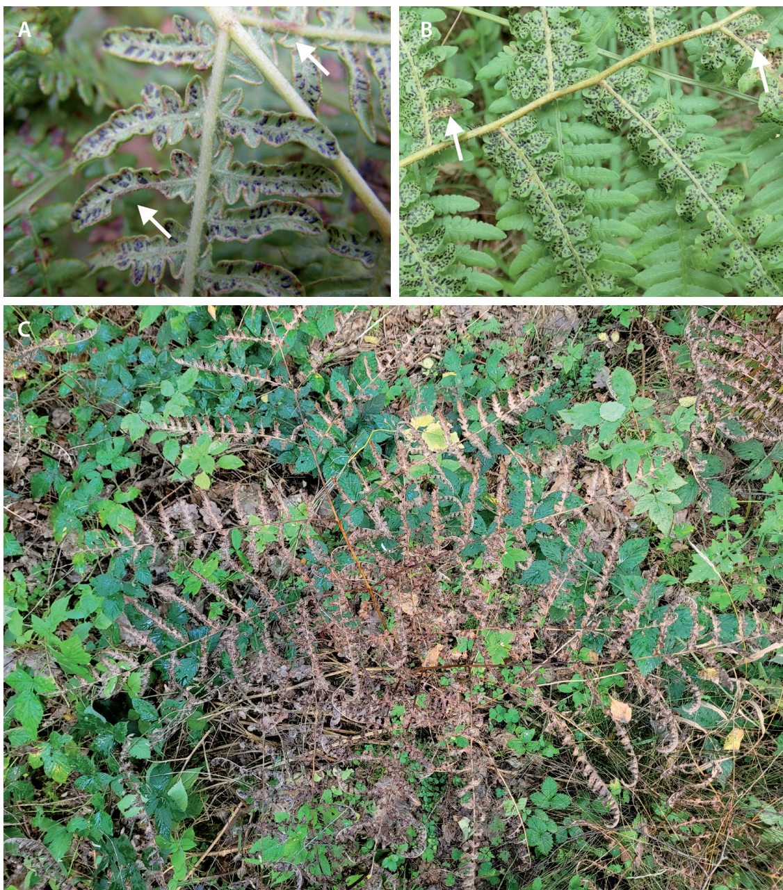
Fig. 3. Crumbled dried leaflet tissue, and dark spots on the rachis (arrows) on pinnules of Pteridium aquilinum subsp. aquilinum from Libiąż in 2008 (A); and curling, browning, and drying of pinnules of P. aquilinum subsp. pinetorum from ‘Dolina Żabnika’ nature reserve in 2019 (B). The most conspicuous symptoms of Pteridium disease in autumn (C)

recorded in 1918-1978: three in Białowieża Forest, two in Wielkopolska, five in southern, and one in southwestern Poland. In 1992-2023, P. Grzegorzek found it in 12 stands (Appendix 1). One of the recent locations of C. pteridis (2008) includes the local bracken population of P. aquilinum ssp. aquilinum on the slopes of Strzałba Hill near the ‘Janina’ coal mine in Libiąż (southern Poland). Ferns were in poor condition (in a dry site, at the end of August), but despite this, evident linear sori were noticeable along pinnule margin, suggesting a readiness for spore release (Fig. 3A) (P. Grzegorzek, unpublished). Hitherto underestimated symptoms of C. pteridis are the drying and brittleness of the pinnule