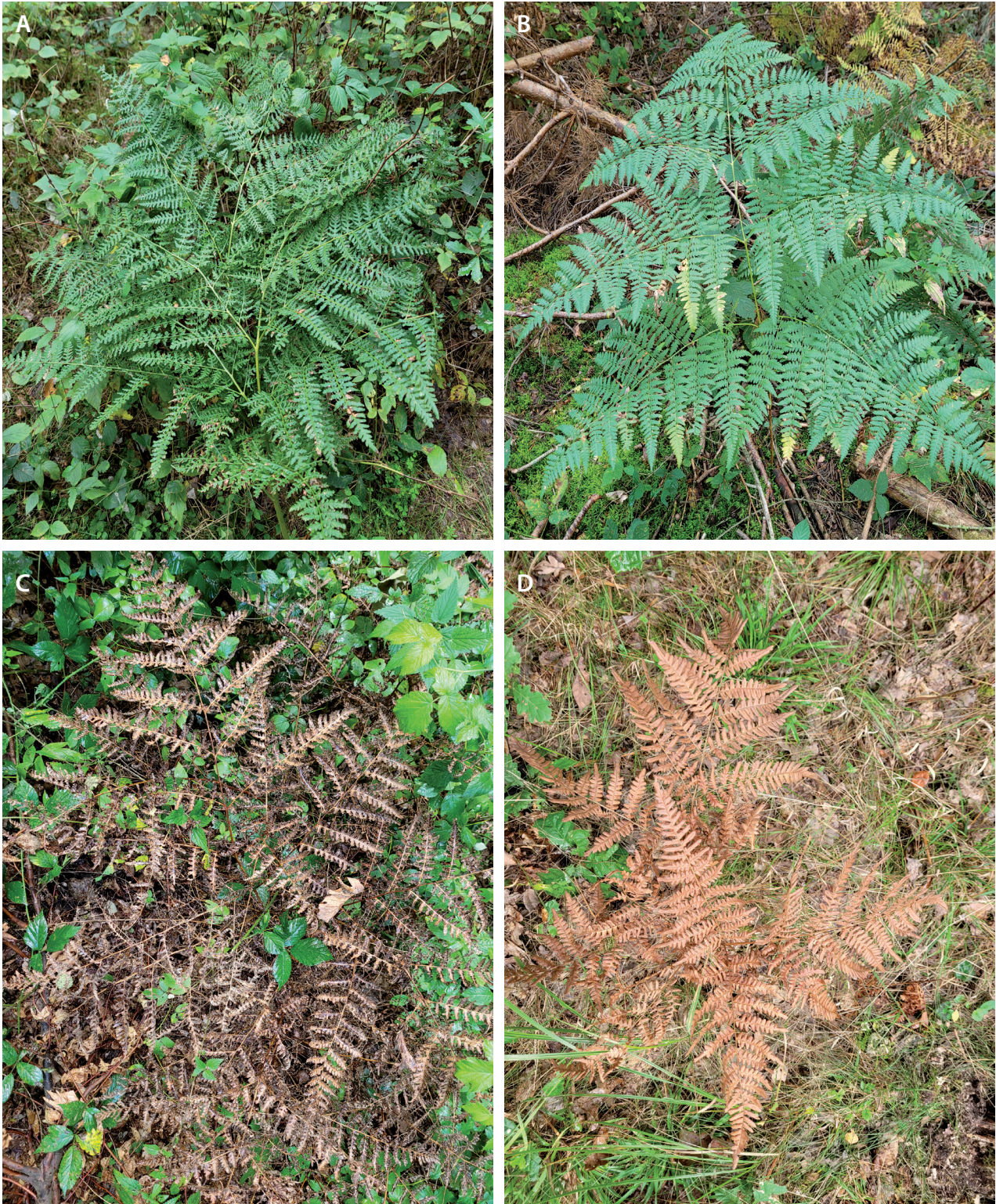
Fig. 2. Comparison of Pteridium aquilinum frond appearance on 28 September 2022: (A) infected with Cryptomycina pteridis and (B) uninfected; and on 13 September 2023: (C) infected and (D) uninfected but completely dry. All found in Budzyń Forest Range

of pinnae and pinnules were observed (Fig. 1B). In the case, the underside of pinnules from Budzyń forest revealed the same symptoms as on pinnae of Pteridium found in the 'Fungarium' sheet of J. W. Szulczewski (Fig. 1 C-D). Those symptoms occurred commonly, on numerous fronds belonging to the same population in