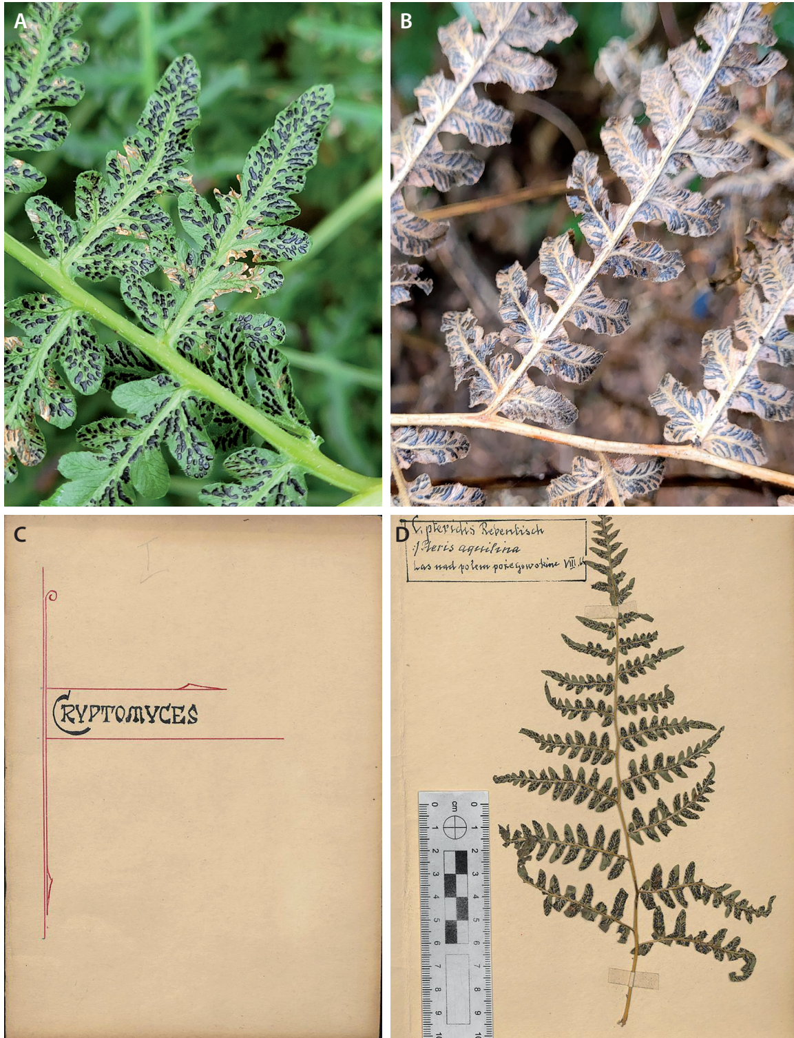
Fig. 1. External evidence of symptoms of Cryptomyces pteridis , on green (A) versus brown and dried pinnules (B) of P. aquilinum. Sheets from 'Fungarium' of J. W. Szulczewski (C, D); dried adaxial side of Pteridium pinnules with symptoms of Cryptomyces pteridis , collected on the edge of Pożegowo Moraine in the Wielkopolska National Park in 1960

the leaf roll symptoms, including upwards curling. The characteristic underside symptoms on green pinnules are convex stromata arranged along the nerves and covered by dark cirrhi containing conidia (Fig. 1A). The infected plant was growing next to a forest path, in an old moderately moist mixed forest dominated by Pinus sylvestris L. with blackberry and raspberry bushes in