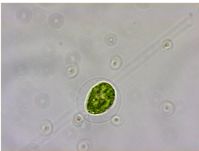
Fig. 3. Flagellate macrozoid stage of Haematococcus pluvialis

The occurrence of Hematococcus pluvialis in the pool in Poznań was a noticeable phenomena due to the alga's red coloration. The color was the consequence of high concentrations of the pigment astaxanthin in the hematocyst stage of this alga. It is a carotenoid that H. pluvialis is capable of concentrating in these resting cells during periods of stress. Most crustaceans, including