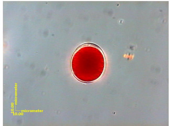
Fig. 2. Resting hematocyst stage of Haematococcus pluvialis

dimensions of 4 x 5 metres. Surface layers of algae attached to the walls of pool were removed and placed in a glass container. Species identification was determined using light microscopy (magnification 1000x) with Nomarskii contrast, according to Rothmaler et al. (1994). Photographs were taken and saved for documentation using Zeiss software KS 300. Pigment analysis and their distribution within the cells were examined using a confocal microscope. The surface structure of the resting cell wall was determined using a scanning electron microscope. The resting stages of H. pluvialis were cultured using WC media and incubated under a 12:12 light and dark regime at 23°C.