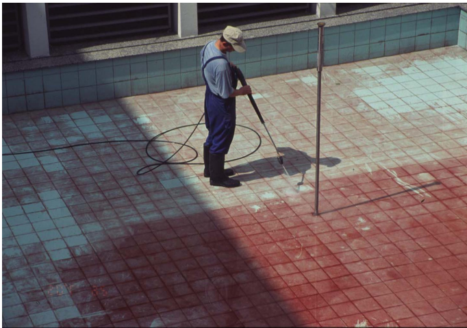
Fig. 1. Haematococcus pluvialis in a small artificial pool on the university campus of the Collegium Biologicum in Poznań