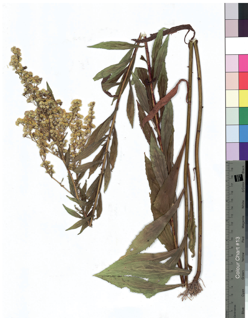
Fig. 1. Herbarium specimen of Solidago ×niederederi Khek from the newly discovered locality in Poland (leg. Artur Pliszko, deposited in KRA)

rhizomes, three-nerved leaves, capitula densely arranged in a pyramidal panicle. In contrast, S. virgaurea , a member of the section Solidago subsection Solidago , has short rhizomes, net-veined leaves, capitula in a cylindrical to ellipsoidal thyrse (Nesom 1993). Both species are outcrossing, insect-pollinated perennials with protandrous flowers (self-incompatibility). They spread by anemochorous fruits (Werner et al. 1980; Melville & Morton 1982) and are diploids possessing the same chromosome number ( 2n=18 ) (Melville & Morton 1982; Rutkowski 2004). The hybrid is morphologically intermediate (Table 1) and produces only very few well-developed achenes (Nilsson 1976). Considering inflorescence and leaf shapes, some specimens are closer to S. virgaurea (Leute 1986).