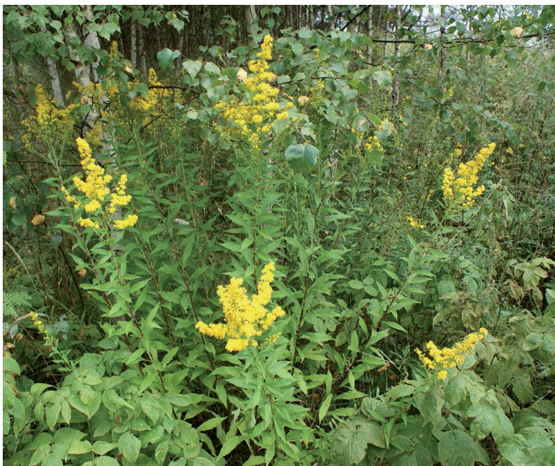
Fig. 3. Flowering Solidago ×niederederi Khek in Mieruniszki village in NE Poland

The population of S. ×niederederi consists of two small clumps (one with 6 stems and the other with 21 stems), which are probably two clones. Individual