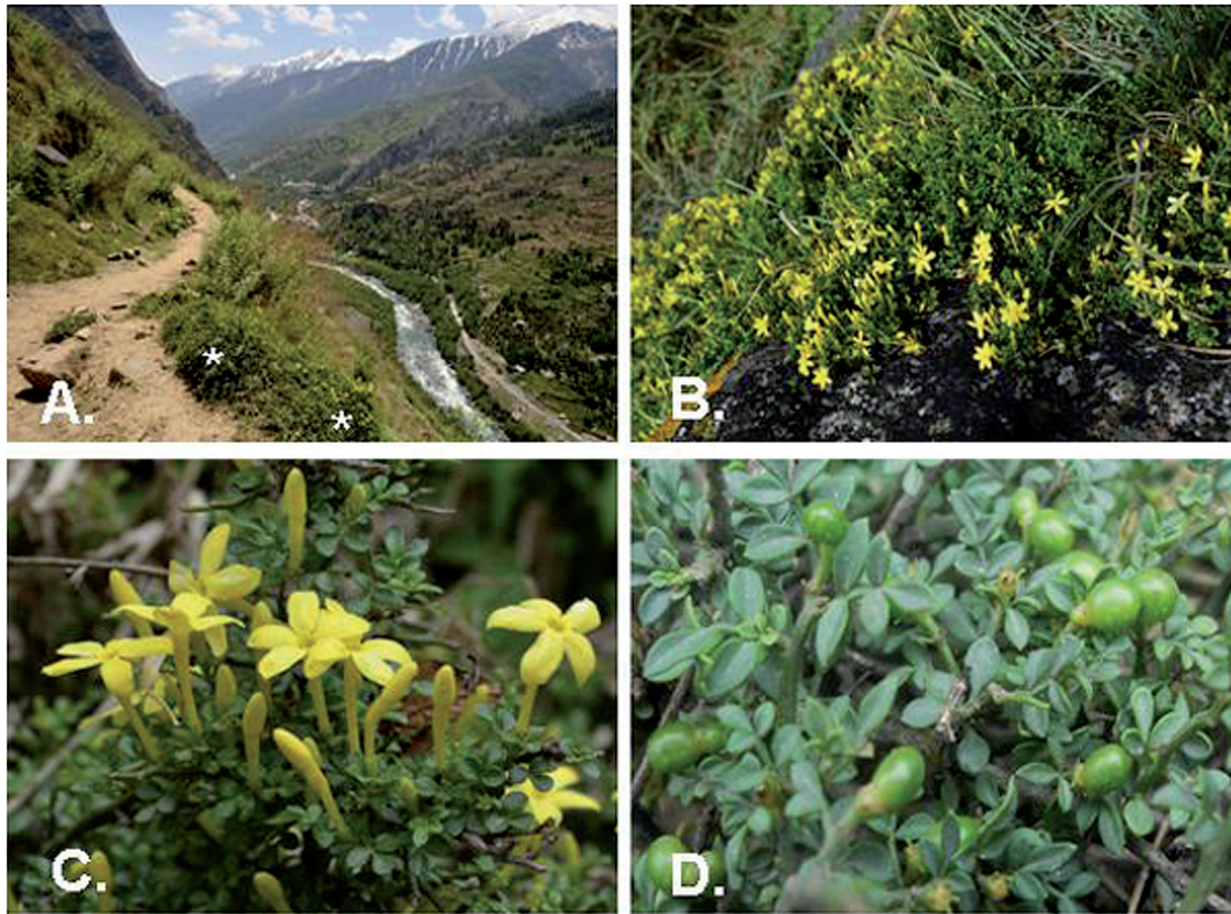
Fig. 1. Jasminum parkeri Dunn: the type locality and different stages of phenology

Explanations: A – plant growing in the type locality, B – general habit, C – Jasminum parkeri in full bloom, D – fruit-bearing plant