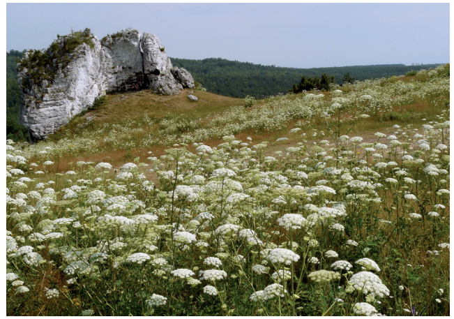
Fig. 2. White cover of Libanotis pyrenaica on the Mirów Ridge (Grzęda Mirowska) in the Cracow-Częstochowa Upland (photograph by M. Palowska, July 2010)