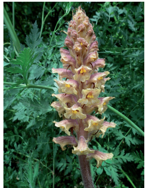
Fig. 4. Orobanche bartlingii Griseb. in Rzędkowice, the Cracow-Częstochowa Upland (photograph by B. Babczyńska-Sendek, June 2011)