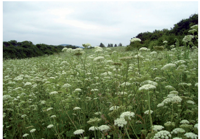
Fig. 3. Fallow land overgrown with Libanotis pyrenaica on the Twardowice Plateau, the Silesian Upland (photograph by J. Hej-dysz, July 2009)