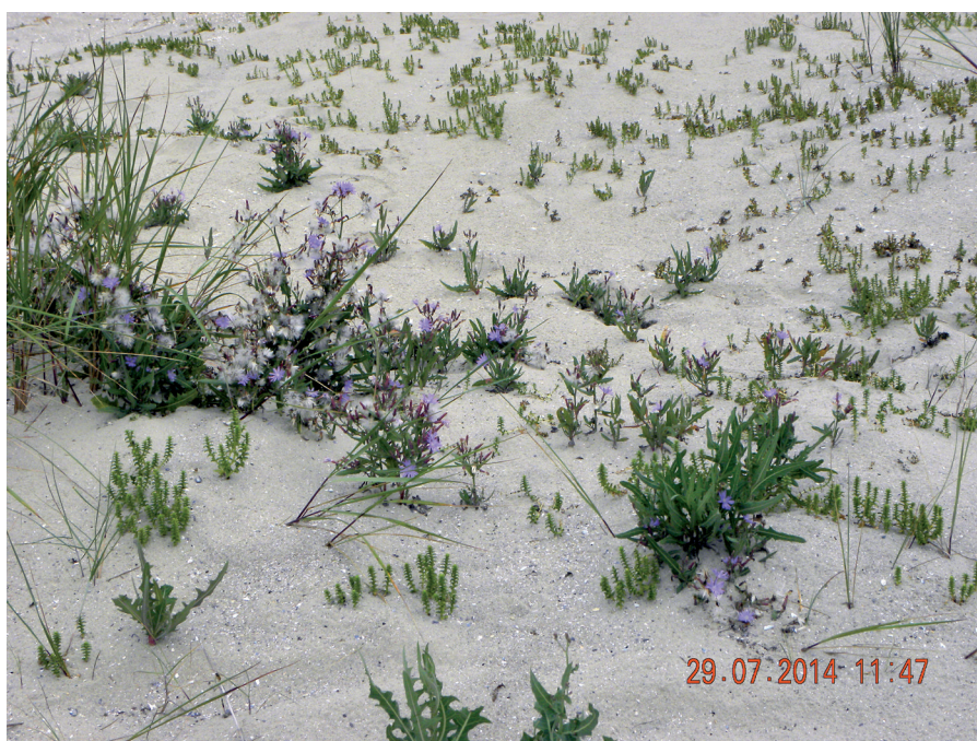
Fig. 4. Honckenyo-Agropyretum juncei with Lactuca tatarica at Świnoujście-Warszów location

salinity level of beach sands is generally very variable, which results from high movement dynamics of \text{Na}^+ ions. The sodium salts are delivered and accumulated by sea water flooding the beach or come out with the wind-blown sand, or are washed away by precipitation. The content of total nitrogen, phosphorus and potassium should be regarded as trace amounts.