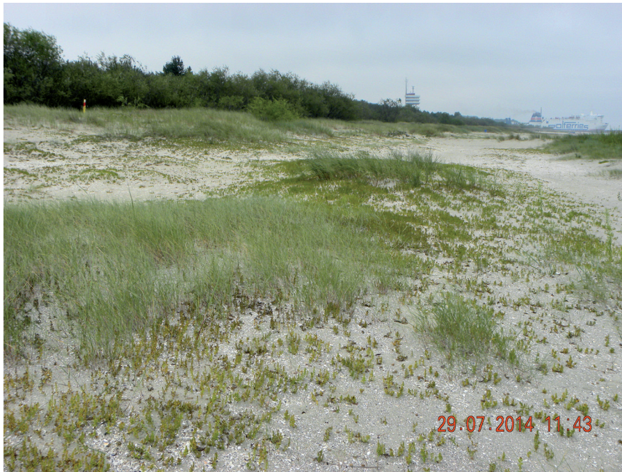
Fig. 3. Costal dunes with Lactuca tatarica in Świnoujście- Warszów

2015). Our Honckenyo-Agropyretum juncei relevés show a vascular plant species number of 7 \pm 1.22 with plot size of 24 \text{ m}^2 \pm 2.34 \text{ m}^2 . The cover values fluctuate at about 45 \% \pm 11.7\% (mean data from Table 1 with given standard deviation, n=5 ). The participation of L. tatarica in the studied patches is 10 to 50% with, 10 to 20 specimens on 1 \text{ m}^2 area. In most patches, young plants in early developmental stages predominate. The