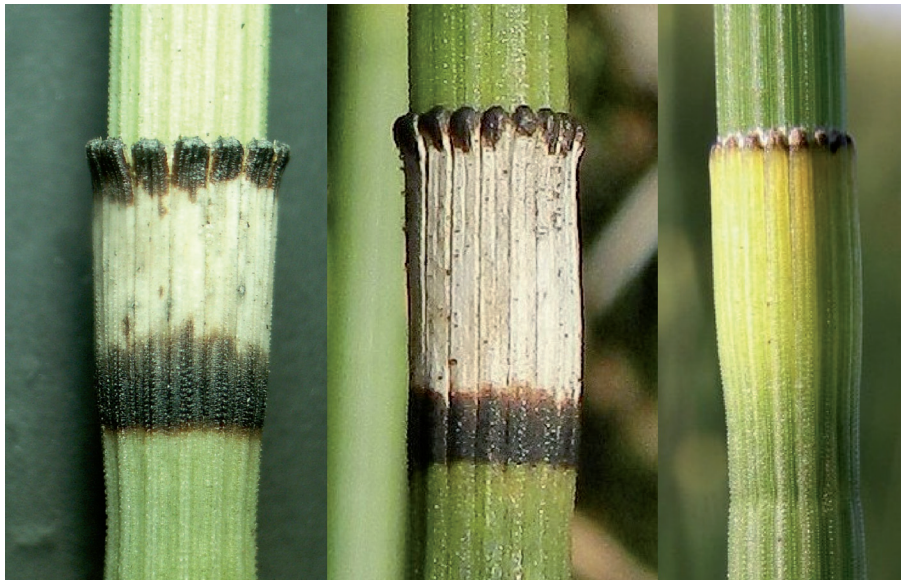
Fig. 1. Leaf sheaths of Equisetum hyemale (left), E. ×moorei (middle) and E. ramosissimum (right)