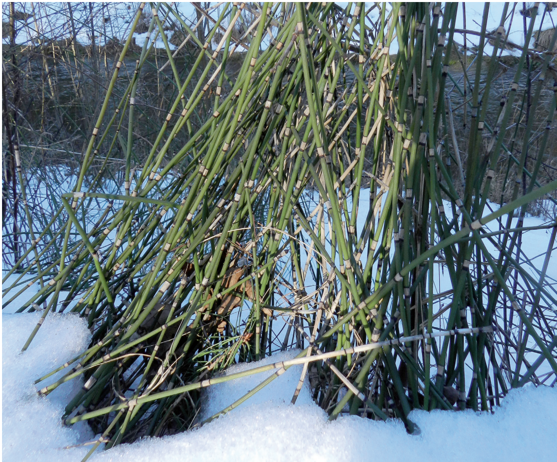
Fig. 3. Equisetum ×moorei near Bolesław (photo by J. Kruk, February 2015)

WRSŁ: BE49, Wrocław-Karłowice, on the old Odra river, leg. R. Uechtritz, 09.1853, WRSŁ000385 (ut E. hyemale schleicheri ) – among E. ramosissimum on the