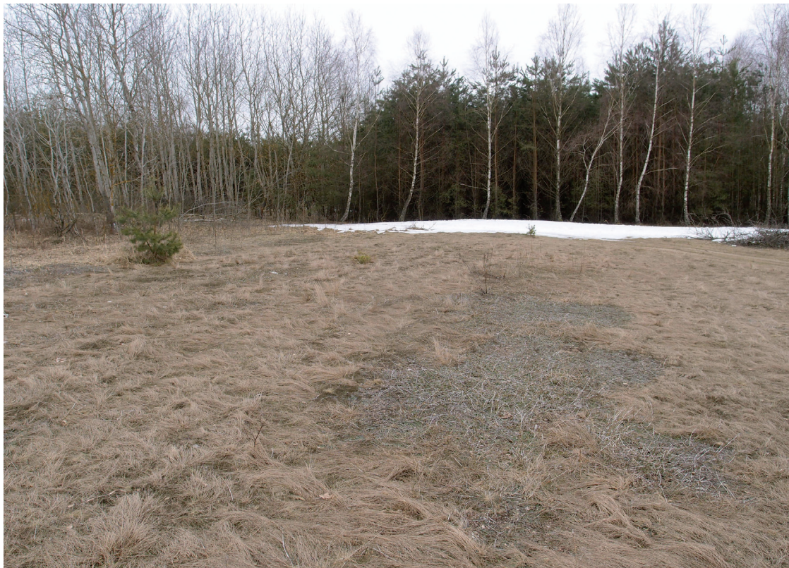
Fig. 2. Habitat of Equisetum ×moorei in Góry (photo by P. Kalinowski, April 2013)

An atypical population of Equisetum sp. was found in 2005 in the valley of the middle Bug river, NW of Góry village, Korczew commune, Mazowieckie province (FD07). Originally, it was supposed that the population consisted of atypical individuals of E. hyemale . However, further morphological and phenological research (the individuals were only partially wintergreen) led to the conclusion that it represented E. ×moorei . This conclusion was also supported by indirect data, i.e. occurrence of both parental species in the neighbourhood. E. hyemale occurs frequently in the Bug river valley and the neighbouring hills (Zajac & Zajac 2001). The species takes/occupies mostly humid habitats, often in oak-hornbeam forests. In such conditions, E. hyemale grows, for example, in forests W of Mężenin (5.75 km from the E. ×moorei site) and in Bartków (9 km). On the other hand, E. hyemale was also found at dry places, on dunes over the Bug river and in pine forests. These sites were located much closer to that of E. ×moorei – in Drohicznyn-Topolina (2.5 km), Zajęczniki-Kozerówka (4.25 km) and in Leonów forest in the proximity of Drażniew village (2.5 km). In these cases, the habitat