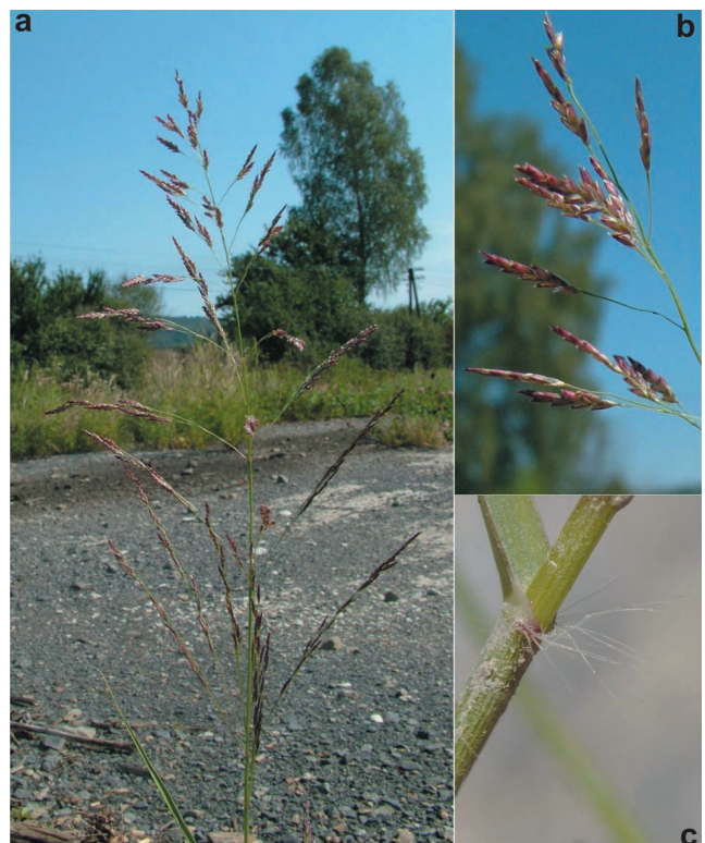
Fig. 1. Eragrostis pilosa in the reloading area by the railway station at Nowosielce

Until 2005, Eragrostis pilosa had been recognized as a holoagriophyte, spreading mainly on sandy alluvia in the Middle and Lower Vistula as well as the Lower San Valleys (Ceynowa-Giełdon 1973; Sudnik-Wójcikowska & Guzik 1996; Kucharczyk 2001). The plant was also reported on anthropogenic sites in Warsaw (Sudnik-Wójcikowska 1981; Sudnik-Wójcikowska & Guzik 1996), Szczecin (Holzfuss 1937; Ćwikliński 1970), Piła (Żukowski 1960), Dęblin (Głowacki 1975) and in the area of the Lubelskie province (Święś & Wrzesień 2002, 2003, 2004). Unfortunately, almost all these data were incorrect and the specimens collected in the territory of Poland, previously identified as E. pilosa , in fact belonged to E. albensis – the species described as new to science by Scholz (1996). What is more, in recent years, an intensive spreading of E. albensis in Poland has been observed (Michalewska & Nobis 2005; Guzik & Sudnik-Wójcikowska 2005; Wrzesień 2005, 2007;