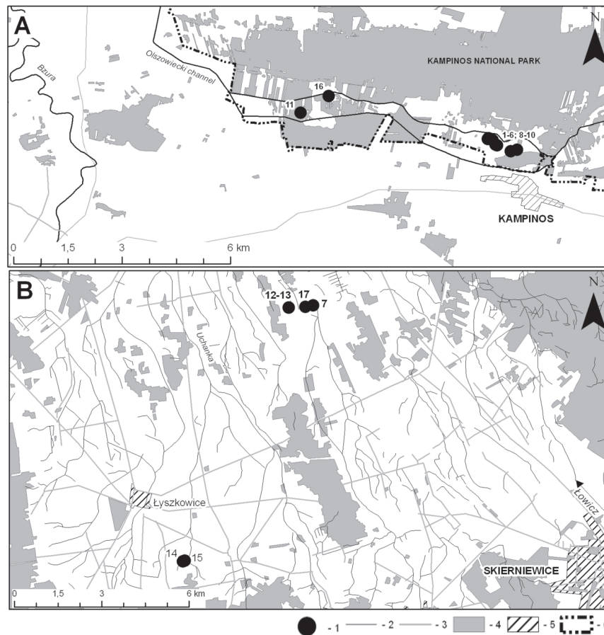
Fig. 2. Distribution of Ostericum palustre in new localities in central Poland Explanations: 1 – new localities, 2 – rivers, streams, ditches, 3 – roads, 4 – forests, 5 – towns, 6 – borders of the Kampinos National Park