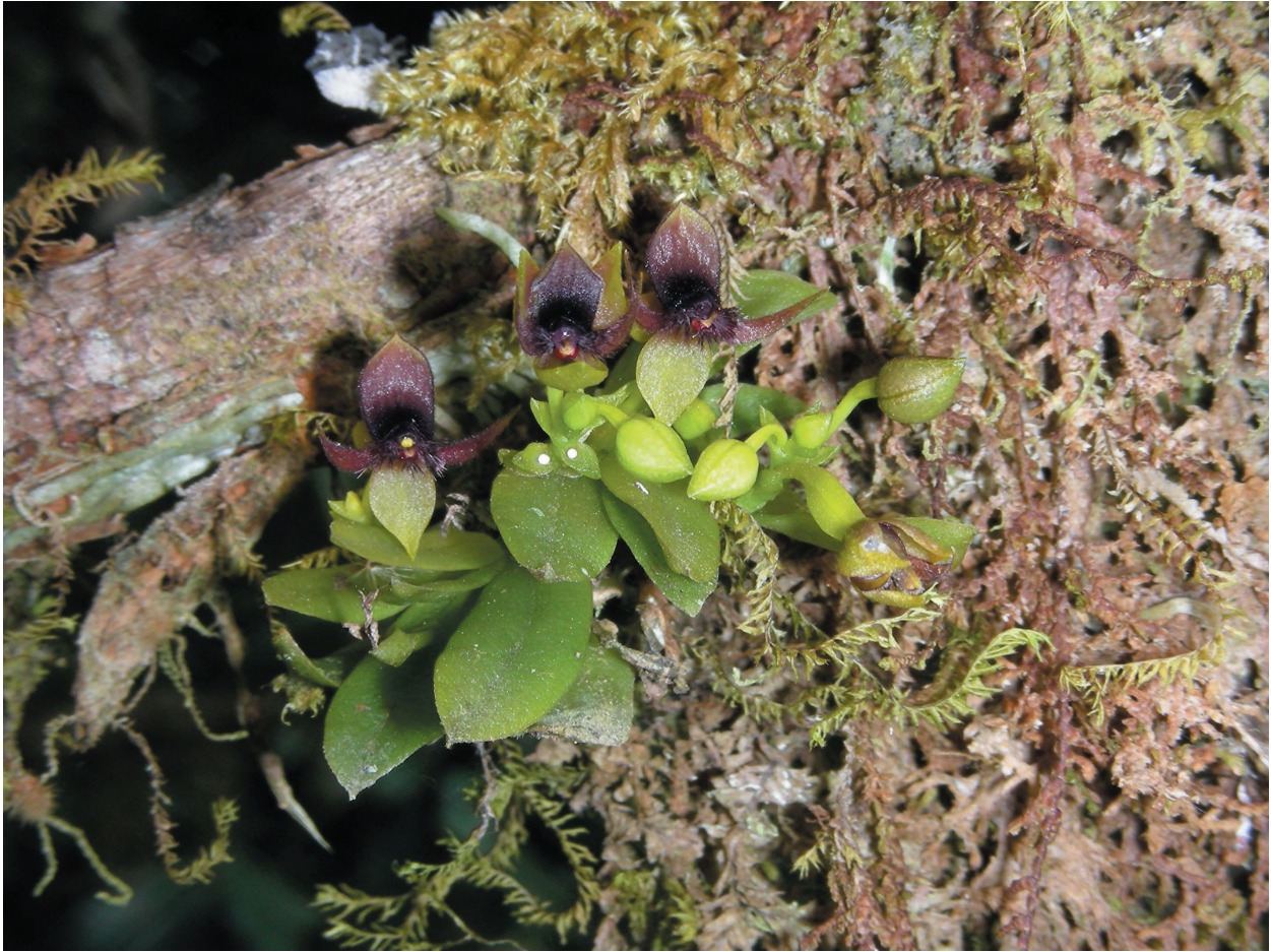
Fig. 1. Stellilabium kukwae – a habit