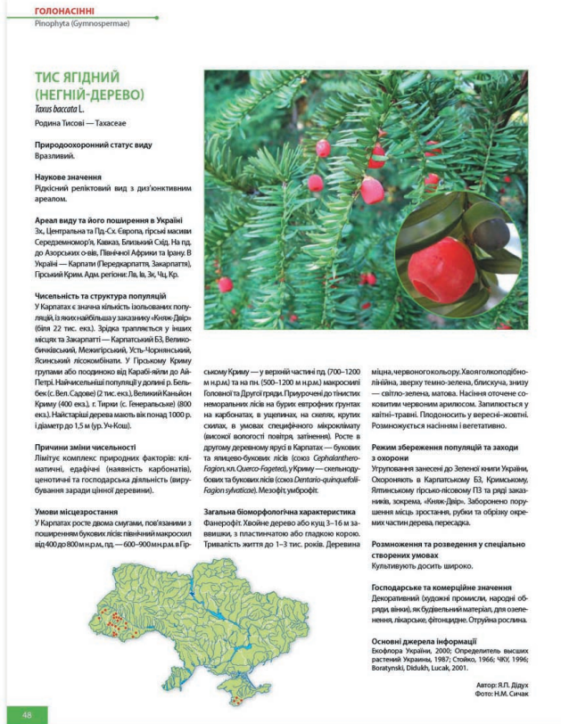
Fig. 2. The example – page from the Red Data Book of Ukraine – Taxus baccata

environmental and coenotic characteristics are presented. This required a large amount of material that was collected by botanists in various regions of Ukraine. Many specimens were collected for the first time. However, we did not manage to verify the presence of species in many localities and to assess the status of populations there, as did Polish scientists. Therefore, this task remains open for the future, because knowledge of ecology of species and the state of their populations makes possible to assess potential threats and develop protection measures.