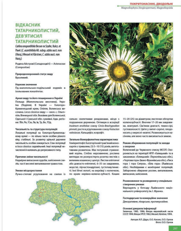
Fig. 3. The example – page from the Red Data Book of Ukraine – Carlina onopordiifolia

Although we could not avoid such declarative proposals as “monitor the status of populations”, “cultivate in botanical gardens”, or “do not violate habitats”, an effort was made to clarify and outline proposals for each species. For example, pasturing, tree felling, changes to the hydrological regime, artificial tree planting, plant collection and, for certain small local populations, even herborization should be restricted. In our view, this approach makes it possible to offer effective measures to preserve certain species. It is known that the protection regime adopted in reserves led to a size reduction or disappearance of populations for which these reserves were created. However, it is illogical to ban the collection of Pistacia mutica in the Crimea, Betula borysthena , Adonis vernalis or Trapa natans ,