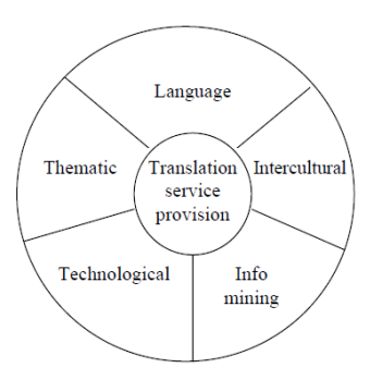
Figure 2. EMT Expert Group translation competence model ( ibid. , 4)

If we look into the components of the production dimension of the translation service provision competence, we find that this competence equates to the strategic competence in other models: