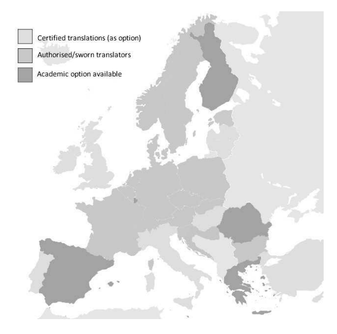
Fig. 1. Geographic distribution of systems for certified translations, state authorised sworn translators and academically authorised sworn translators (Pym et al. 2012, 29).