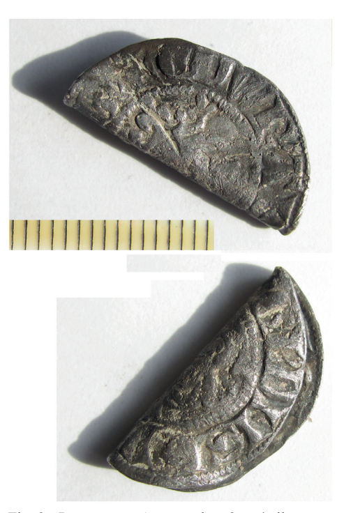
Fig. 3. 'Prayer penny', worn class 3 or 4 silver penny of Edward I (1280–9), deliberately folded over. NMS-A0A4B8, Norfolk Museums Service (Courtesy of the Portable Antiquities Scheme, scale in mm)

indicate that their purpose was to be deposited at a pilgrim shrine, it is not clear why these folded coins are found in the ploughsoil away from them. Perhaps some other processes connected with popular devotion are in evidence here, but while these are just loose coins brought for recording with no information of local context, associated material and evidence, we can just guess. Unfortunately the PAS record shows that before these artefacts reach the recorder, in order to make it more collectable, the finder has very frequently used a heat treatment to unbend the coin – sometimes damaging the object as well as altering its original folded form<sup>8</sup>.