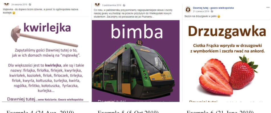
Example 4 (24 Aug. 2019)

The entry variants may enjoy the same status – these cases were described in the preceding subsection as the accompanying lemma; they may also be subordinate to the major variant which serves as an entry word. The first type of registering variants is more frequent (12 out of 16 posts). The second type includes bejmy 'money' and its synonyms baniole/banioki/szut 'coins, change' (8 Oct. 2019), a participle unorany 'soiled' and its synonyms usznujdrany, uślabrany, uślumprany, uszmudrany, uszmodrany, uśluńdrany (19 Aug. 2019), pyzy 'steamed yeast dumplings' and kluchy na łachu. The record is held by kwirlejka with 19 identified variants (example 4).