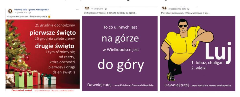
Example 1. (25 Dec.2019)10

What is more, the text can be dominated by graphic elements like in example 3. The entry word luj written with a capital letter (not standard spelling), written in a bolded font, much bigger than the definitions, disappears next to a large male figure wearing a yellow, eye-catching T-shirt. This example also shows that, while a division into graphic and textual elements is useful in ordering an analysis, gets frequently blurred in the material; here, the man leans against the entry word.