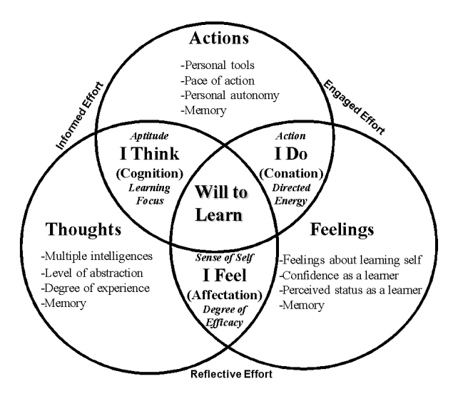
Figure 2. The interaction of mental processes within each learning pattern

A distinguishing feature of the ILM theory is its representation of the mental processes which operate within each of the four learning patterns. These mental processes consist of cognition (thinking), conation (doing), and affectation (feeling) (McClean 1978; Snow, Corno & Jackson 1996). Figure 2 illustrates the interaction occurring among the mental processes of each of the four patterns.