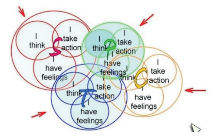
Figure 3. The interaction of all three processes interacting within each of the four learning patterns Source: prepared on the basis of Borkowski, Carr, Rellinger & Pressley (1990: 53–92).