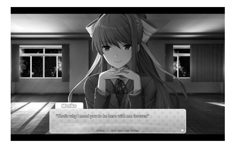
d. Doki Doki Literature Club. Monika in her forever room

Ultimately the game reaches the point where Monica turns off everything except for herself and an empty room for her to sit in and wait for us. Every time we start the game, she will be there still. But the game is not finished yet. The player can choose to let Monika be or to delete her file from the game files. The second option triggers one of three possible endings, depending on the player's previous actions in the game ("Possible Endings"). The ending, whatever it may be, is permanent, though; the end screen will still be shown when the player enters the game. The only possibility to relive it is to reinstall it.