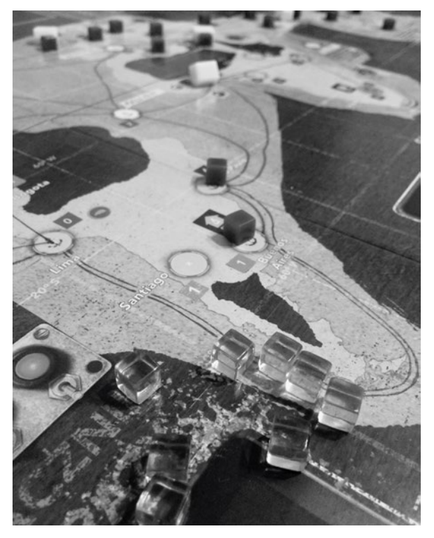
a. Pandemic Legacy: Season 2. The board