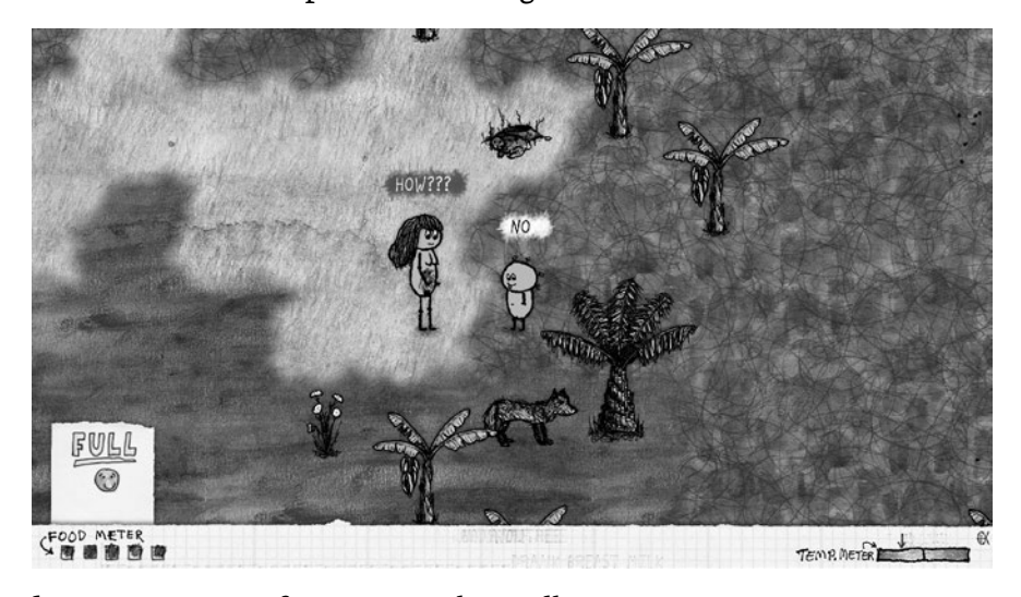
b. One Hour One Life. An untimely goodbye

The first experience in One Hour One Life is a series of short, colourful, fragmentary lives. The beginning is hard; the player has to survive in the unknown world and experience its miracles and dangers. Playing the game, I was born many times, and many times I died in infancy. Once of yellow fever. Many times because of starvation, abandonment, or the animals of prey. In one of the lives, my family dressed me in a wolf skin and called me wolfboi. In another, I was supposed to collect roots and berries, but I died of a rattlesnake bite. Finally, I reached adulthood and had children. I named them. I taught them. I saw their deaths. I experienced all that with strangers whom I will never talk to again. But I can still live another life. With time, I became less and less attached to the characters in the game and the events mattered less to me as they started to be repetitive. The game can be mastered with repetitions. No passage, no situation, no character will come back exactly the same, and it is hard even to find the same places in one of the next games; but the game remains open and after multiple sessions players are able to learn its rules - and be more powerful in the game world.