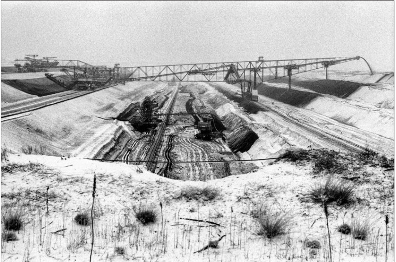
Il. 1. Atterwasch, by Marco del Pra' & Frédéric Dubois.

In 2014, a small team around photographer Marco del Pra' and myself released Atterwasch [15] a browser-based documentary about a village in Lusatia, on the German-Polish border. The 20-minute documentary tells the story of uncertainty with which its inhabitants are confronted – the uncertainty of whether or not their home will be erased to make way for the extraction of lignite underneath.