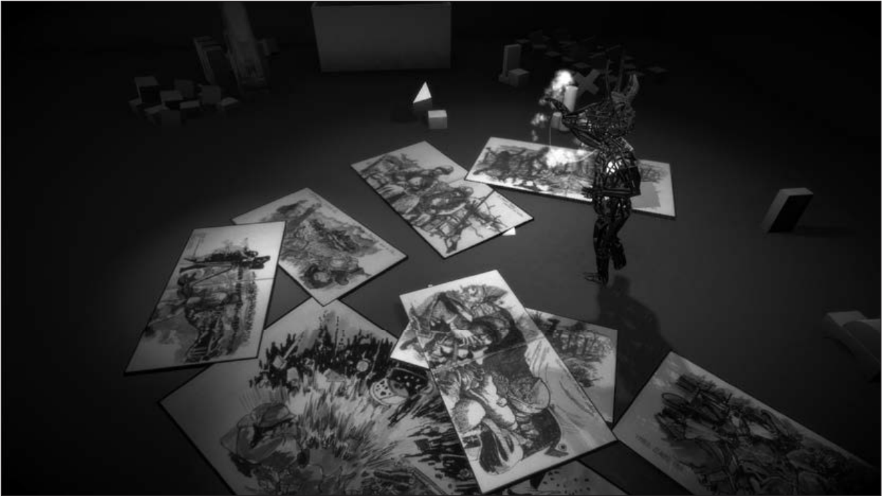
Il. 5. The Unknown Photographer.

This said, while this feature of being inside is proper to VR documentary – not web-documentary – once the position of the person is cleared (inside the box, not in front of the screen), it is the interactivity confronting the user which transforms the relationship to reality. By advancing, turning, running, looking up and down, by gazing, the user progresses in the story and thereby performs a form of travelling. The act of travelling in the story and being in conversation with the documentary material through ‘interactive signs’[22] surrounds the user, making the experience vivid, and as close to reality as one can get.