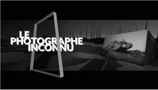
Il. 4. The Unknown Photographer.

photography. The completely 3D-modeled environment visually resembles a walk-through with an audio-guide in an augmented museum exhibit. The user is on the battlefields of World War I, and does his own parcours through the trenches listening to the first-person narration of an old man trying to recollect what his position was in that period: was he a war photographer, was he a soldier, and what do the exhibited photos tell us?