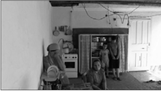
Barzakh , dir. Montas Kvedaravičius, 2011

film therefore has a structure that is close to a dream-like state. The scenes from the life of Hamdans family are interwoven with poetic images of nature, water, air, longshots of faces, prayer and fortune-telling. For the director these are metaphors of a state in which the sense of reality becomes blurred and relaxed. The appalling confines of the jail plastered in blood, where prisoners are tortured, the testimonies of people that have been physically disfigured and tortured, their helplessness, the atmosphere of insecurity and the suspension between the two worlds of the dead and the living, all serve to make this film one that shatters our sense of reality – one that shall long remain in our memory.