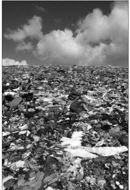
The Field of Magic , dir. Mindaugas Survila, 2011

Recognised as the best Lithuanian documentary for 2011 The Field of Magic ( Stebukly laukas , 2011) from Mindaugas Survila is a documentary epic poem about those living on a rubbish tip. The film shows how people beyond the social pale, socially marginalised, exist, the majority earning their living by penetrating the mountains of refuse in search of metal – living in small cardboard shacks. The rhythm of life is marked out by the arrival of the rubbish truck. The director does not place his film within the stream that Brian Winston named victim documentaries . [3] The documentary