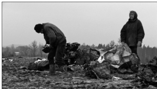
The Field of Magic , dir. Mindaugas Survila, 2011

clad in a blanket of snow. Then, after an editorial cut we see a close-up of a colourful Jay in a feeding tray illuminated by the intensive sun. These two rather illustrative images (opening and closing the film) imbue a softening form to the future dramatic and naturalistic story of the people. Among the daily routines of poking about in rubbish, being down and out, hunger and a search for food and water, the director also integrates two moving sequences.