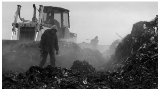
The Field of Magic , dir. Mindaugas Survila, 2011

clad in a blanket of snow. Then, after an editorial cut we see a close-up of a colourful Jay in a feeding tray illuminated by the intensive sun. These two rather illustrative images (opening and closing the film) imbue a softening form to the future dramatic and naturalistic story of the people. Among the daily routines of poking about in rubbish, being down and out, hunger and a search for food and water, the director also integrates two moving sequences.