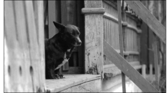
Ashes, dir. Eugeniusz Pankov, prod. Polish National Film School in Lodz, 2013