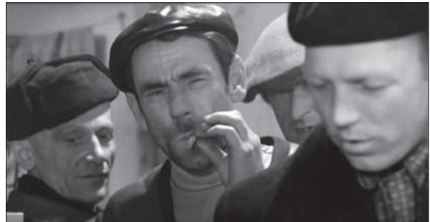
Il. 3. Scene from the film Struktura kryształu showing the “simple” folk whom Marek despises

Referring to the philosophical tradition, one can say that Jan looks at reality from an angle. In rejecting the reality of the city, he achieves his own Copernican revolution as when he says, “It depends on how you look.” Thus, Marek is right when he sees a big bright modern world; but in a sense, everyone at some level is right. Semantic affordance allows me to assume that the reality seen in Struktura kryształu is always fragmented, and not because of the demands of the poetics of the film, but because there is no cognitive perspective which is holistic. This is probably why we see Puława as a city in construction, as if Jan and Anna wanted to show Marek that this is their world, and not other, and at the same time, this is not their whole world. Marek the scholar, steeped in a positivist, almost scientific, perspective, falls for the illusion that what one knows of the world is the same as what the world is. This is why