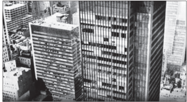
Il. 1. Frame from Struktura kryształu presenting images of American skyscrapers, seen by the lead characters through slides

Marek, being the “soul of the city” and coming from it, represents modernity which Vattimo calls “progressive enlightenment”[16] which