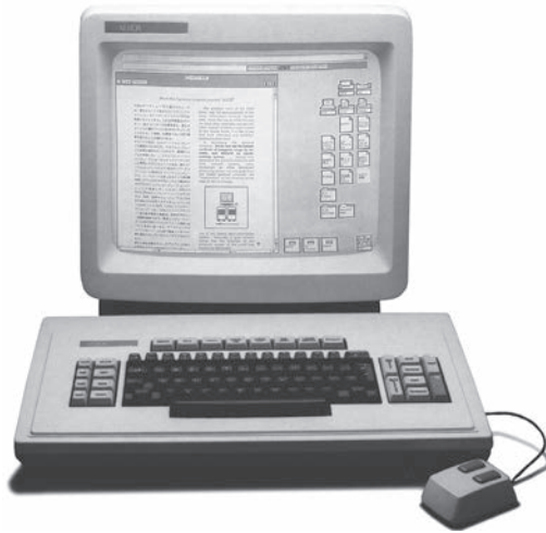
Il. 6. Xerox Star.

represents your working environment – where your current projects and accessible resources reside. On the screen are displayed pictures of familiar office objects, such as documents, folders, file drawers, in- baskets, and out-baskets.[70]