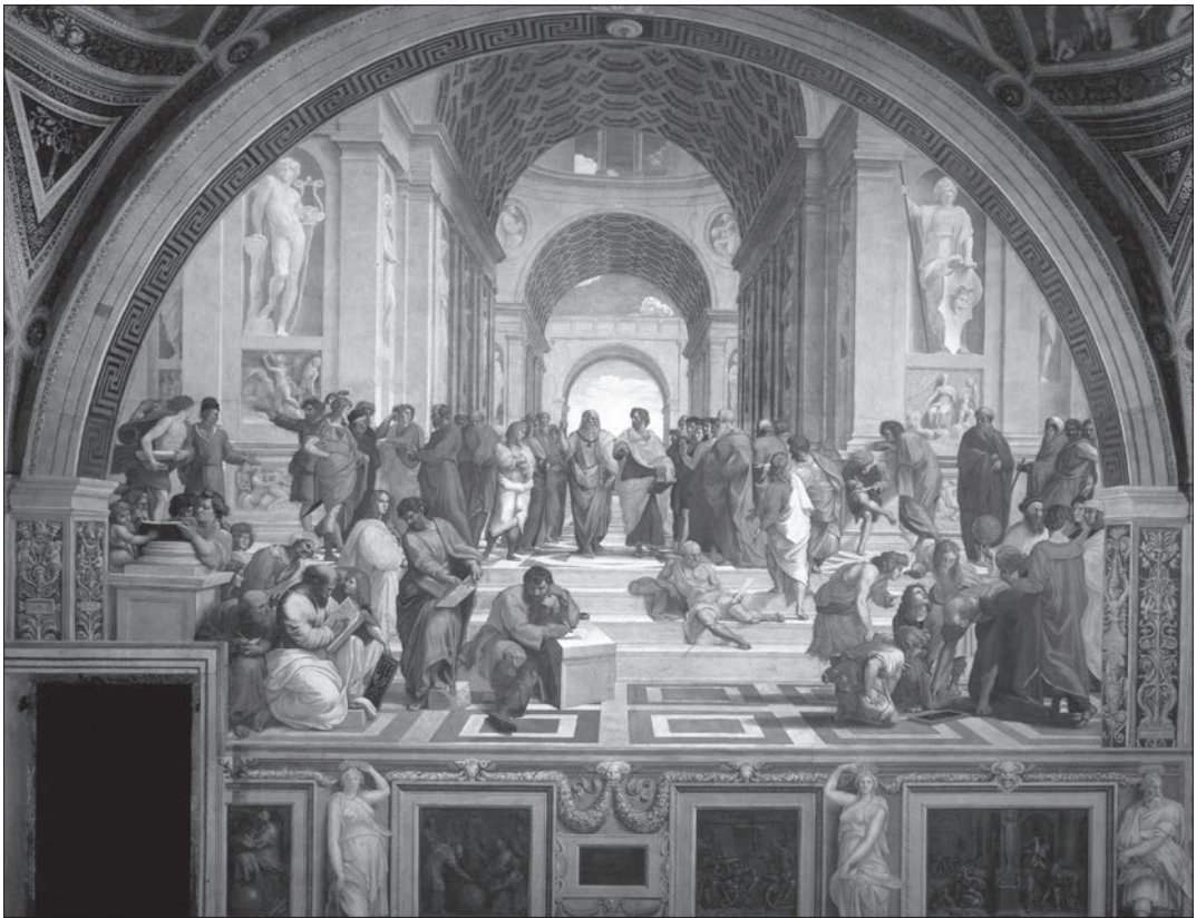
Il. 4. Raffaello Sanzio da Urbino, The School of Athens .

tangible materials (the painting and the mirror) materially framed the viewing experience of the spectators, dictating the position and movement of the eye, so the effect of “looking through” at a represented space could be achieved. Following Brunelleschi, Leon Battista Alberti simplified the method and compared perspective paintings as windows: “First I trace as large a quadrangle as I wish, with right angles, on the surface to be painted; in this place, it certainly functions for me as an open window through which the historia is observed, and there I determine how big I want men in the painting to be [...]”[58] Alberti’s window does not open onto reality, but functions as a transparent display that shows a representation of narrative space (“ historia ”).[59] This painting technique became important for many artists.