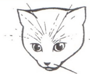
Drawing 1. The “Reading” test: task no. 5

Cat has just one whisker. Draw him the second one