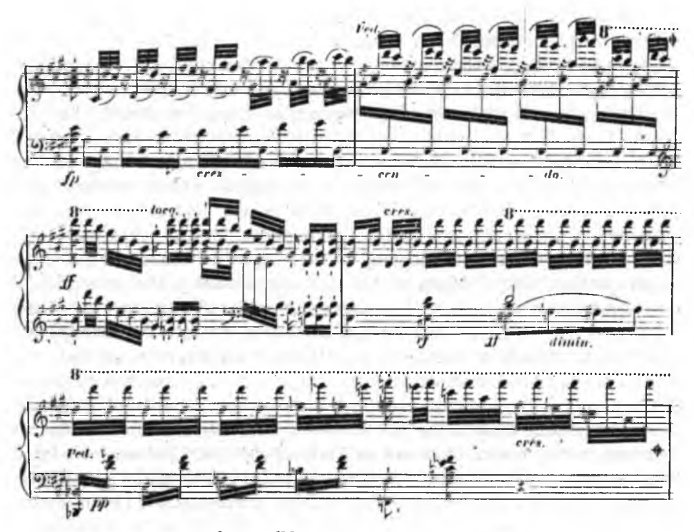
Example 6. Kalkbrenner, Concerto in A minor , Op. 107, fragment of coda

Differences between Kalkbrenner and Chopin are also discernible in their etudes. The etude belonged primarily to the canon of pedagogic literature at that time, but it also developed as a concert piece. Both types clearly illustrate the aims and activities of performers representing the style brillant. For example, in Kalkbrenner's Traité d'harmonie du pianiste, one finds etudes serving the teaching of improvisation on the piano. A didactic aim is contained in the sets of Études , Op. 20 and Préludes , Op. 88, ordered according to the circle of fifths. Other cycles (such as Opp. 143 and 161) also specified the area of pianism addressed. The etude, when cast as a set of technical devices, became a compilation of figures given priority over form. In this context, the phenomenon of the Chopin etude is not linked to the style brillant as such. In the process of integrating textural means with the flow of a composition, Chopin employed individual stylistic solutions. In both his sets of etudes, he transcends the technical-virtuosic rhetoric of the style brillant , enriches the pianistic substance and lends the etude an artistic form. He displays a dynamic approach to the impulses deriving from musical practice, developing and synthesising.