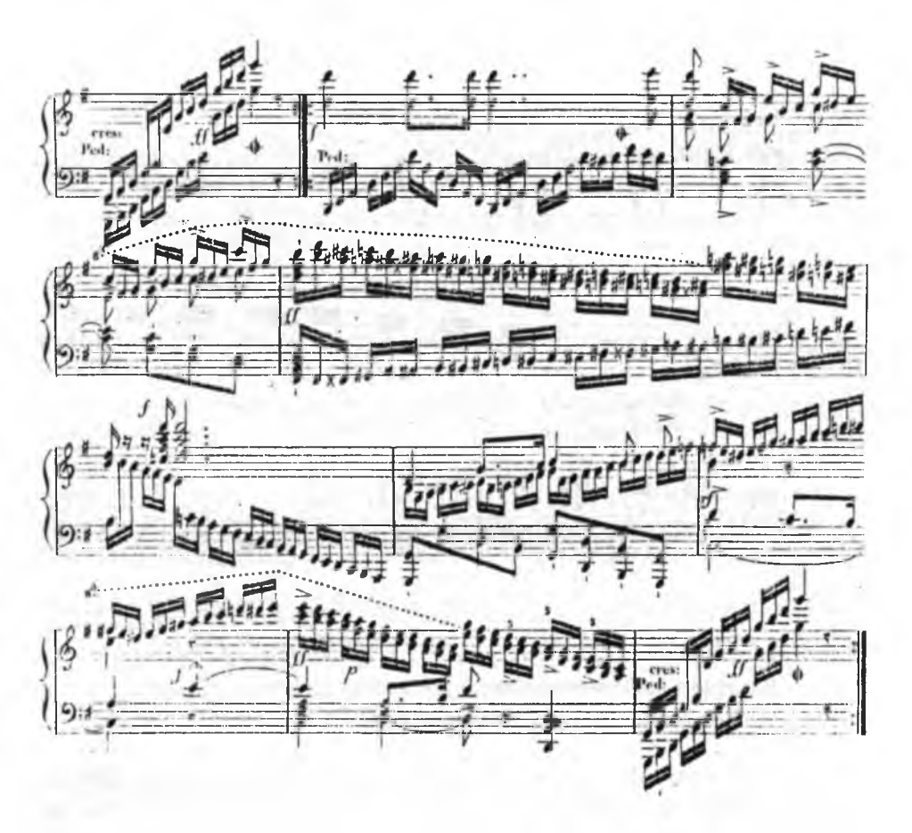
Example 2. Kalkbrenner, Grande fantaisie et variations brillantes , Op. 140, fragment of Variation I

mentarily (in the first two variations) fills only the degrees of the diatonic scale in the figurations or is connected with a sequence of chords and intervals of a third. (Example 2)