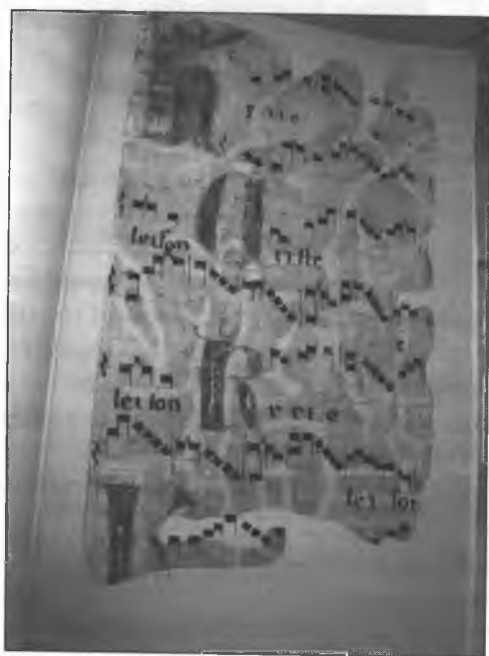
Illustration 10 Missal from Łowicz, fol. 2r; reconstituted sheets.