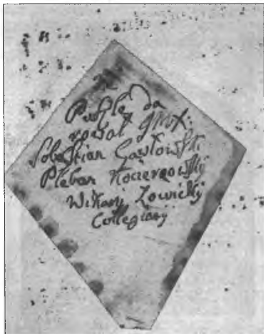
Illustration 8 Bernardine antiphoner from Sieraków, BUW K 213/56, fol. 275v; glued-in insert with provenance.

Also in this book, we encounter characteristic features of orthography. These are not regionalisms, however, but Polish versions, or simplifications, of Latin spellings: for example, 'Kwi' instead of 'Qui', and 'Fak nos' for 'Fac nos'. This may be due to carelessness on the part of the copyist or simple ignorance, due to an inadequate education, but it also might be evidence of the general vulgarisation of Latin, which was used only during the liturgy and was disconnected from everyday life.