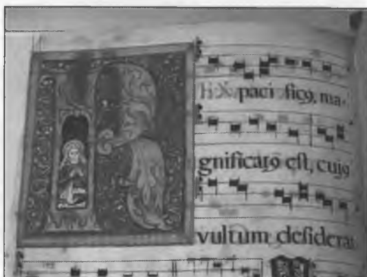
Illustration 3 Bernardine antiphoner, BUW Mus 99, fol. 8v; initial of the Christmas antiphon.