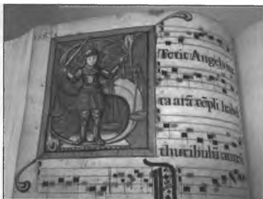
Illustration 2 Bernardine antiphoner, BUW Mus 99, fol. 188r; St Michael the Archangel.