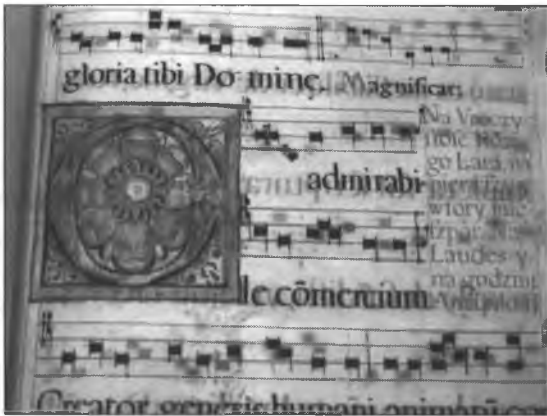
Illustration 5 Bernardine antiphoner, BUW Mus 99, fol. 39r ; initial of the New Year antiphon.