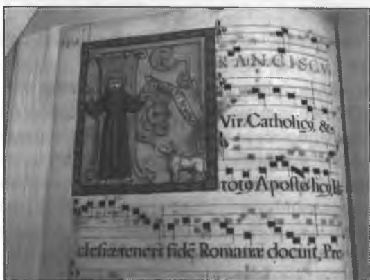
Illustration 4 Bernardine antiphoner, BUW Mus 99, fol. 183v; St Francis.