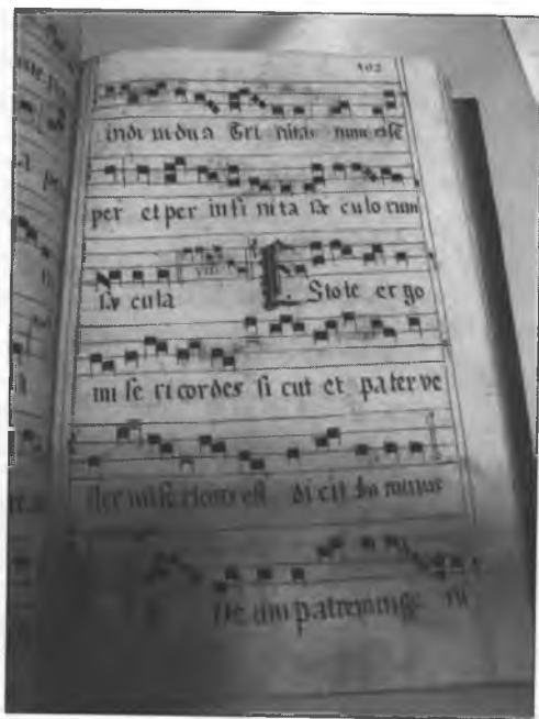
Illustration 9 Bernardine antiphoner from Sieraków, BUW K 213/56, fol. 102r; fibula (detail).