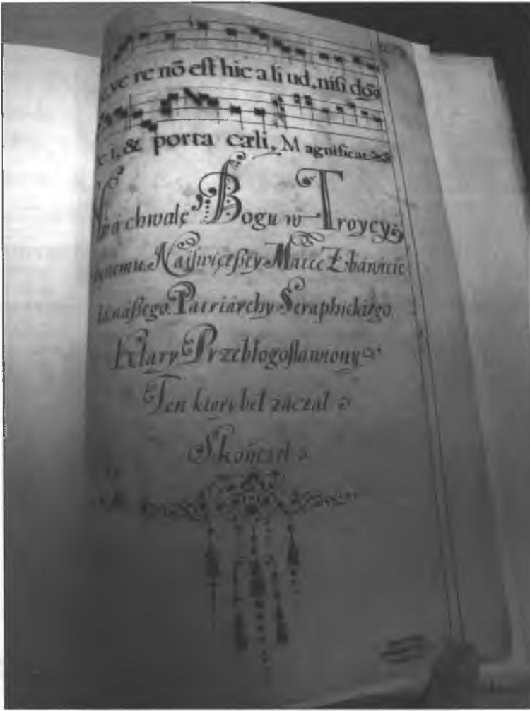
Illustration 1 Bernardine antiphoner, BUW Mus 99, fol. 253r; copyist's inscription.

The original binding with boards covered in leather, together with the metal ferrules and clasps, has also been preserved, and the spine still shows remnants of gilding. The sheets, which carry numerous annotations by copyists and users of the book, show signs of having been repaired many times with wastepaper obtained from older Latin prints and music manuscripts dating from around the seventeenth and eighteenth centuries; this indicates that the book was used a great deal.