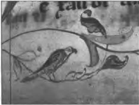
Illustration 11 Missal from Łowicz, fol. 75 r; example of a miniature in the margin of the sheet.

273 sheets in total, measuring approximately 455 x 275 mm. The original leather-on-board binding also survives, together with the clasps. The ornamentation in this manuscript is much more modest than in the first book discussed here, but in places we find ornamentation in the margins which is modelled on older-style illuminations, as well as colourful, decorative initials (Ill. 11). An exceptional elaborate decoration is found on the sheet with the Mass for the dead. At the top of the page, someone drew an extraordinarily realistic skull and bones – a characteristic element in the iconography of Bernardine spirituality, where thoughts of death and the necessity of doing penance in this life were ever present.