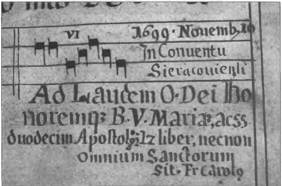
Illustration 7 Bernardine antiphoner from Sieraków, BUW K 213/56, fol. 275r; provenance inscription with date and copyist's name.