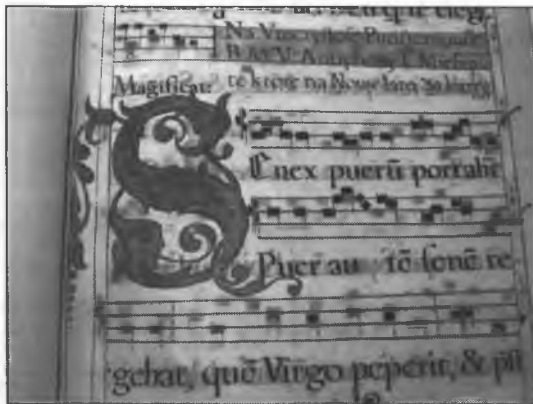
Illustration 6 Bernardine antiphoner, BUW Mus 99, fol. 28r; initial of the antiphon for the Purification of the BMV.

As early as the beginning of the seventeenth century, it began to create a book collection, which gradually increased, partly thanks to collections bequeathed to the monks by priests. In 1818, the partitioning authorities ordered the cassation of the monastery, which took place on 10 February 1819. The church and its fixtures were made over to the parish, while the moveable contents found their way to the remaining Bernardine establishments. 3 The church and the monastery building, including the original early Baroque, mannered decor, have survived in