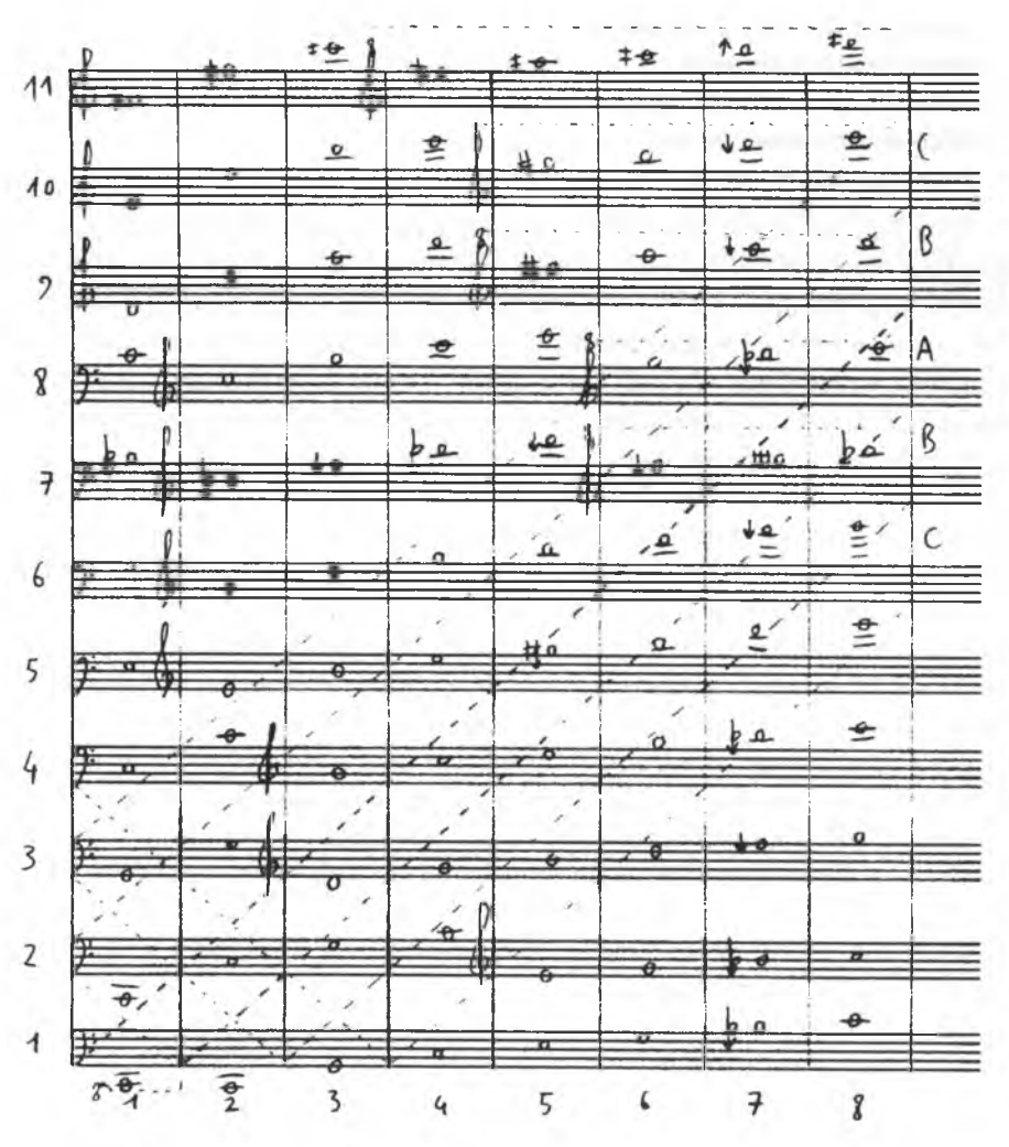
Figure 4: pitches diagram for Giovanni Damiani's symphony Matrice/Organon.

ourselves back into nature forever. But culture is nonetheless also cultivation of nature: of mineral, vegetable, animal and human nature.