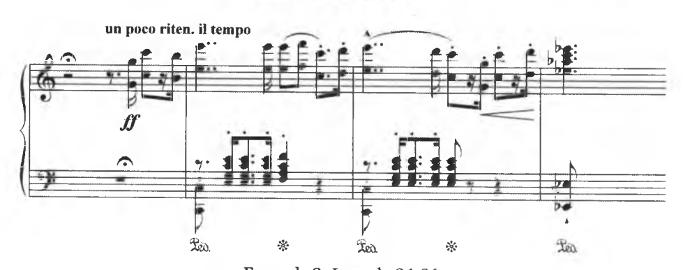
Example 2. Lyon, b. 34-36

The development (bars 46-117) opens the third theme ( T_3 ), which constitutes a quasi -quotation of the first phase of La Marseillaise ; this specifies the extramusical meaning of the piece. The marching character remains the same as in the two previous themes, the texture is once again changed – diverse articulation of the individual elements creates two sound planes (Ex. 3). What happens here is also the change of key (C major into A major) and dynamics from f into f into f. This part is divided into six phases, which are defined mainly by changes in the texture, emphasized by differences in dynamics and musical notation pointing to the character of each segment. The two f motifs are the main object of the processing, while tension stems from their diverse juxtaposition. In this part there are