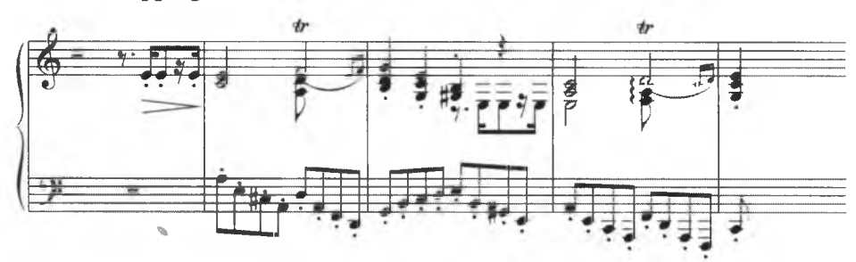
Example 3. Lyon, b. 46-49

numerous modulations, strong chromatization, changes in the tempo and register of the instrument, and irregular rhythmic groups with unevenly placed accents. Reprise (bars 117-151) begins with T_2 , and the themes undergo further processes of transformation. The first theme is presented in two variants: one more complex in terms of texture and the other reduced, in piano dynamics, sotto voce . The coda (bars 151-187) sums up the piece, in which the elements of the two main themes recur, overlapping each other.