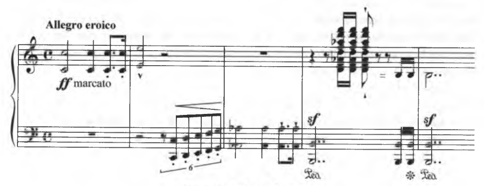
Example 1. Lyon, b. 1-5

to Schubert's song Erlk\"{o}nig (in the transcription by Liszt) (Ex. 1). This musical quasi-quotation is an extremely personal reminiscence of an oeuvre played by Liszt and Nourrit during their stay in Lyon. The second theme ( T_2 ) with its march character, dynamics (ff), and tonality coincides with T_1 ; what changes there is the texture – monody is replaced by a doubled octave melody accompanied by chords (Ex. 2), which leads directly to the cadence closing this part with the E major chord and a pause with a fermata.