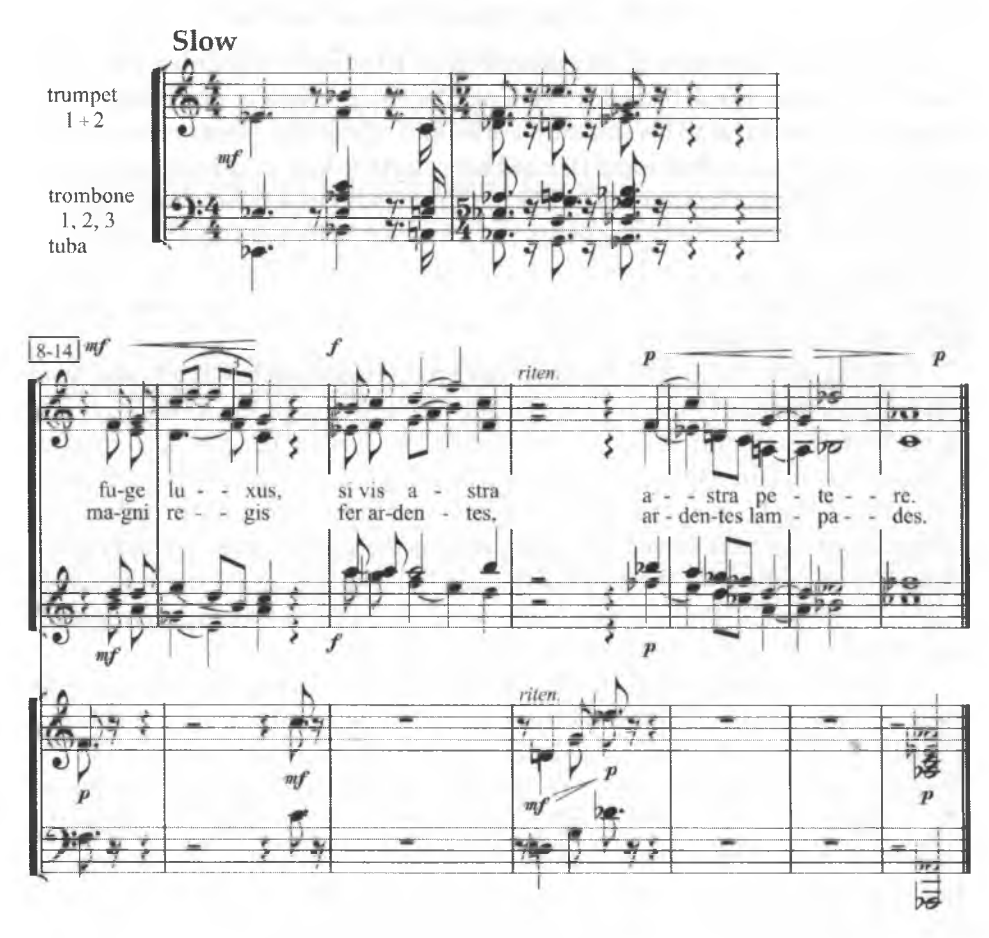
Example 7: The concluding admonition of the heavenly judge, first and third sections

instruments" silences with short homophonic gestures, the choral voices then add their own imitation, with the motivic line in simpler rhythm and dense legato taken up by the sopranos over a richly harmonized texture in the other voices (mm. 11–13). Finally, the chorus and shortly after it also the brass ensemble end in the A-flat-major triad that had served the first movement as its anchor.