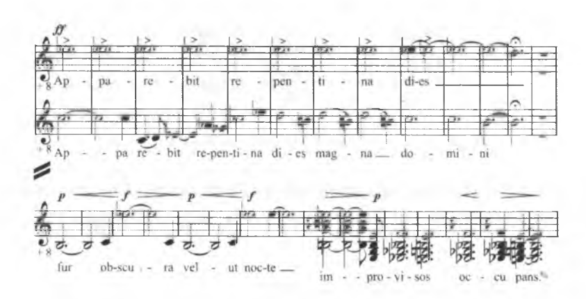
Example 3: The incursion of the Last Day, out of the blue

As if to compensate for this substantial non-vocal segment, the ten brass players remain largely silent when the chorus finally enters, comparing in the hymn's first couplet the "great day of the Lord" with a thief who irrupts upon unsuspecting sleepers in the dark of the night: