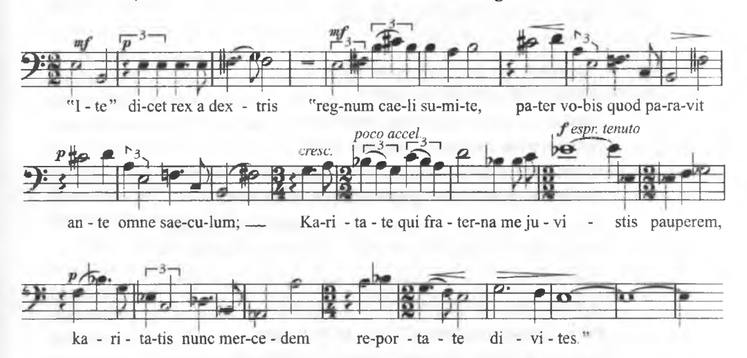
Example 4: Christ and his evangelist in the recitative of the basses

The two times four couplets of the hymn devoted to the two contrasting parts of the dialogue between Christ and the souls he has come to judge correspond to sections B C1 D and B" C2 D" respectively. An agitated passage marked quasi Recitativo is reserved for the basses who, with scant support from horns and trombones, articulate Christ's words as well as the evangelist's reflections: