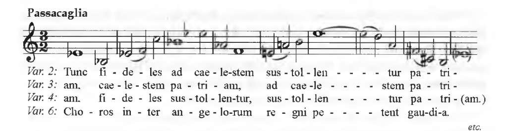
Example 6: The passacaglia theme of the chosen ones

The theme, solemnly swinging in large note values, is embedded in and woven through by various secondary voices moving mostly in quarter- and eighth-notes. In the first seven of the fifteen variations, both the voices carrying the theme and those engaging in contrapuntal play present the first couplet of this hymn segment (see the text cited in the above music example). The mood changes when the narration turns to the entry of the faithful into the eternal celestial realm. In variation 8, the theme is heard as a mere faint shadow played by the homophonically accompanied first trumpet. Though riddled by multiple rests, it is to sound soft and quiet, or so Hindemith's instruction suggests. The choral texture, suddenly also homophonic and simplified to two strands, softens even more when it returns in variation 9 to its earlier three-part setting. After this, listeners will hardly be surprised by the tenth variation, in which Hindemith evokes the city of light and true peace in unaccompanied four-part singing concluding with a phrase ending in augmented note values.