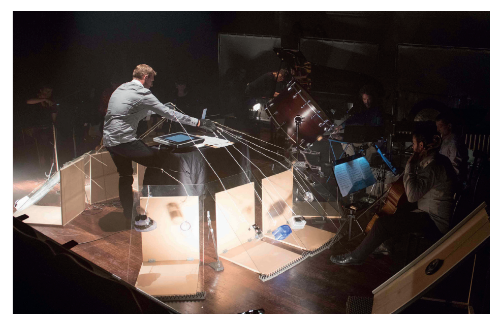
Figure 3. Nadar Ensemble performing Ghost of Dystopia by Khubeev