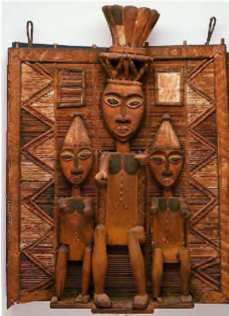
(a) Kalabari Memorial Screen 'Ijaw Duein Fubara', late 19th century, Minneapolis Institute of Arts

manics, and that even if art's function was tied with what we would call its aesthetic properties, this function was not to elicit the sort of aesthetic response or experience we typically have. Similarly, a great deal of primitive art completely disregards the aesthetic function – the sculptures of the Kalahari of southern Nigeria are valued for their capacity to contain spirits, and 'some evidence suggests that as visual objects, [they] tend to evoke not merely apathy but actual repulsion' (Horton, 1965: 12). For another African people, the Lega, 'carvings are apparently used simply as vehicles for communication and not valued for their intrinsic form.' Moreover, 'if a carving is broken or lost, or taken by an outsider, most initiates are not unduly worried, replacing it with "something that is functional and ... is the semantic equivalent"' (Layton, 1991: 10; after Biebuyck, 1973: 164)