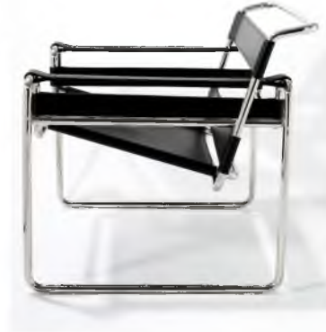
(c) Marcel Breuer, Wassily Chair (Model B3 chair), 1925, designed in Bauhaus and exhibited e.g. at the The Museum of Modern Art, New York