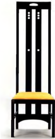
(b) Charles Rennie Mackintosh, Ingram Street Tea-rooms chair, 1900, Kelvingrove Art Gallery and Museum, Glasgow