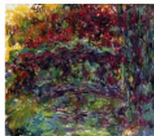
(c) 1918-24, oil on canvas, Musée Marmottan, Paris; painted after the cataracts were removed