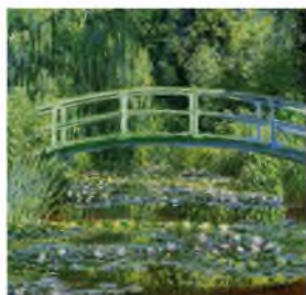
(a) 1899, oil on canvas, National Gallery, London; painted before any symptoms of the cataracts developed

One solution might be to claim that the borderline is at the point at which the receiver is able to correctly recognise the work's non-aesthetic properties. 5 It seems quite intuitive to say that a person who is not able to recognise the colours on a given painting will not be able to correctly experience it, or judge whether it is aesthetically pleasing or not.