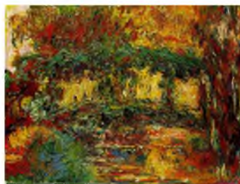
(b) 1918-24, oil on canvas, The Minneapolis Institute of Arts; painted about the time of most severe disability