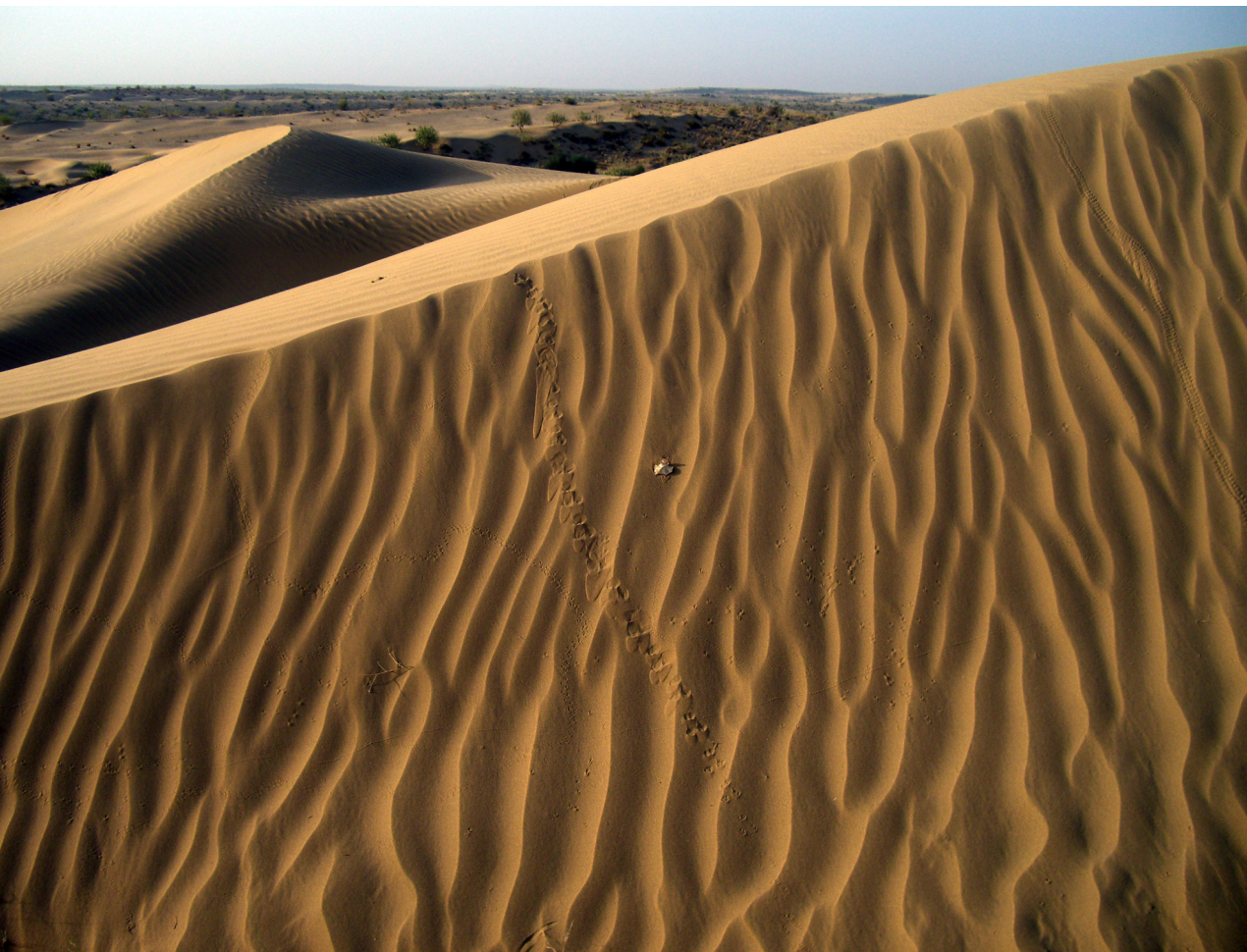
Photo. 2 The Thar Desert, India.