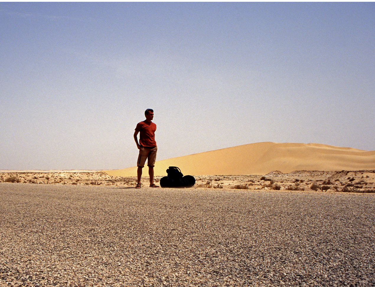
Photo. 4 A Road, Mauritania.