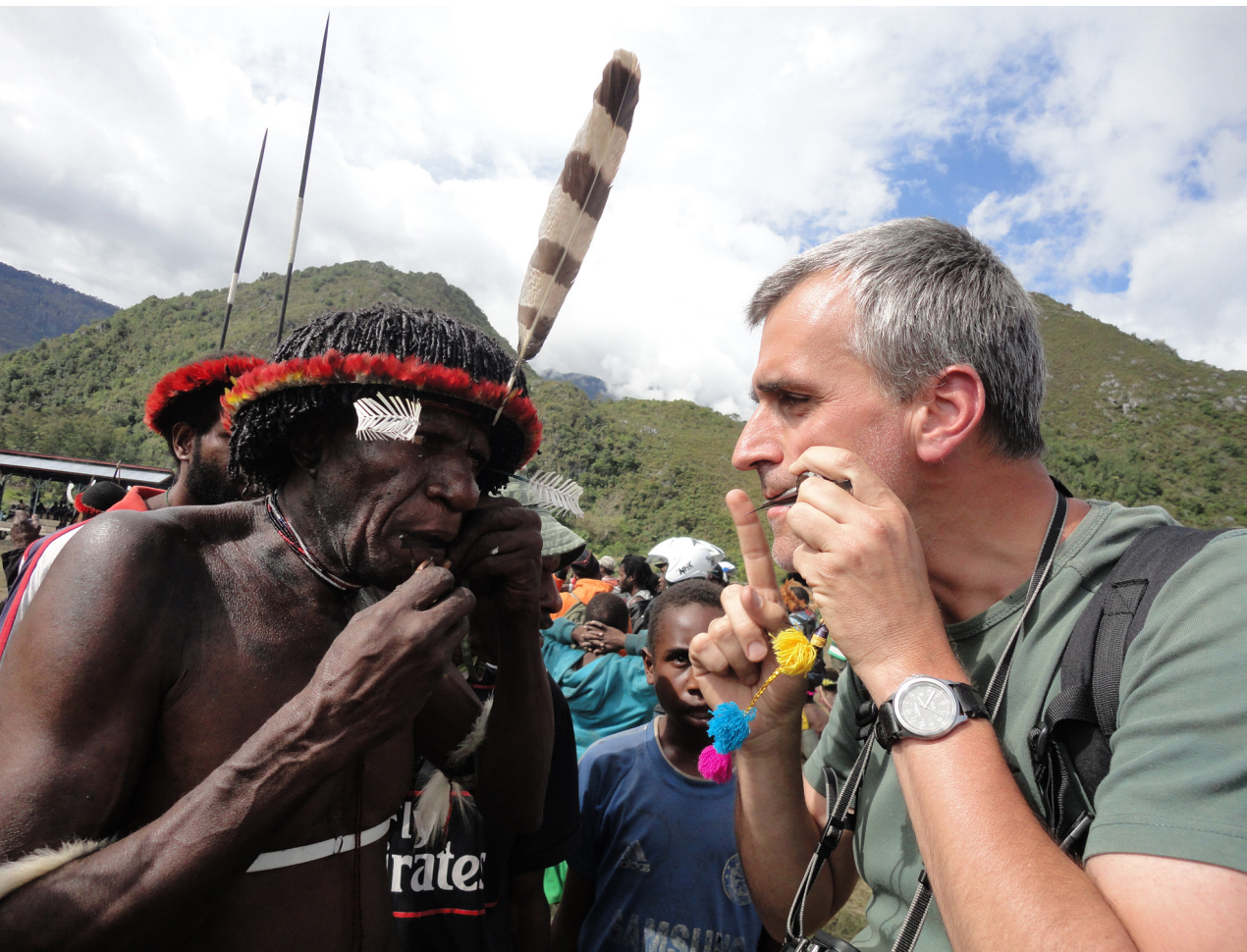
Photo. 6 West Papua.