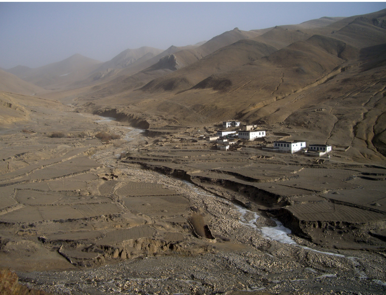
Photo. 8 Tibet.