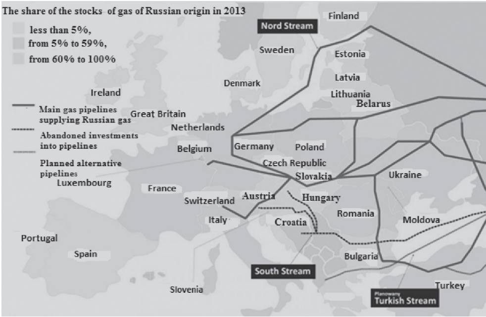
Fig. 2. The degree of member states' dependence from gas import from Russia (in %) in 2013