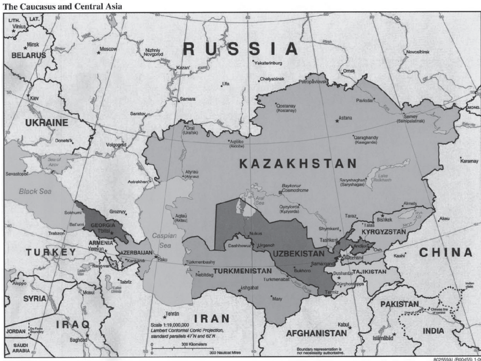
Map 1. Map of Central Asian countries 2