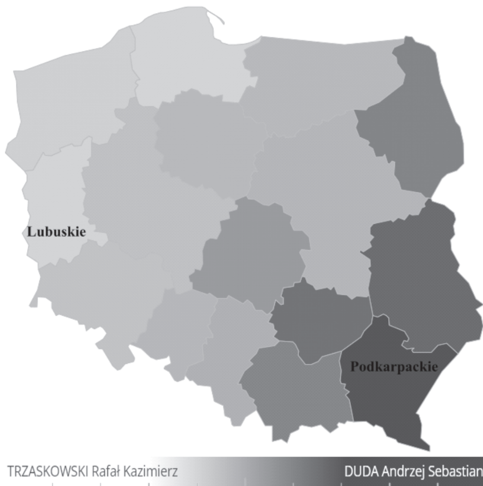
Figure 1. Support for Andrzej Duda and Rafał Trzaskowski in 2nd round of 2020 presidential elections

The difference in voting preferences between both regions was even more visible in 2020 presidential elections: Podkarpackie strongly supported the right-wing candidate Andrzej Duda (who took 71% of the vote), while Lubuskie strongly supported the left-centre candidate Rafał Trzaskowski (60%) (National Electoral Commission, n.d.). This dichotomy is illustrated by the Figure 1, that is presented below.