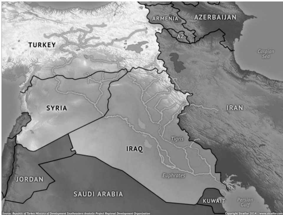
Map 1. Map of Tigris-Euphrates Basin