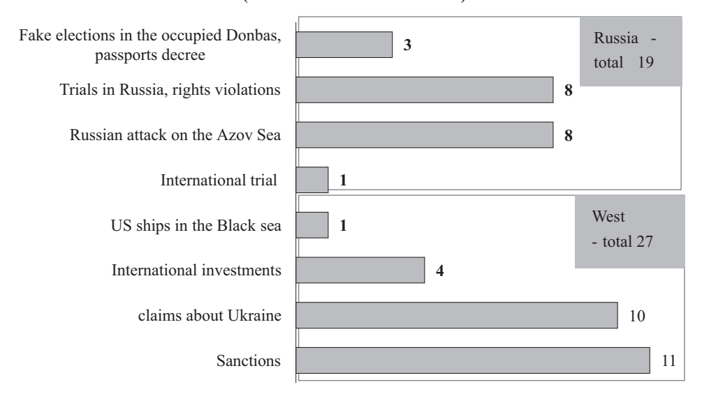
Fig. 3. Poroshenko's Tweets' (reaction to events, claims) main topics (Western countries and Russia)

It's also possible to define the main topics of former Ukrainian president's Tweets by category (see fig. 3)