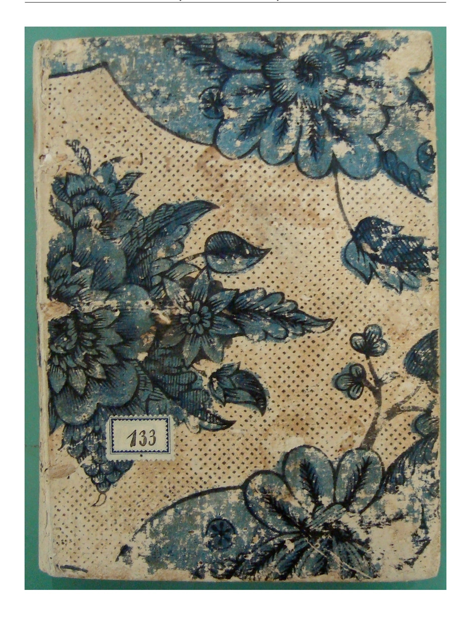
Figure 1. An example of the original binding of one of the twenty manuscript volumes from Ferić's collection (AMB MS 133).