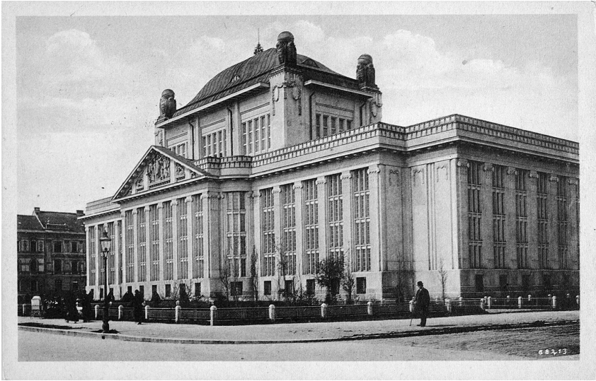
Fot. 3. The building of the University Library and the Land Archives (today the Croatian State Archives) (HR-HDA-1684. Postcard Collection, Zagreb-131).

province. Sensitivity to the preservation of written historical heritage, with rare exceptions, was almost non-existent. The legal provisions prohibiting the destruction of archival materials were not known to the competent provincial authorities, nor did they comply with them. In such conditions, the first and fundamental task of the then archival service was to save everything that could be saved, mostly by transfer to the Zagreb Land Archives. In this way, since 1895 hundreds of meters of archival materials had been delivered to Zagreb through purchases, takeovers ex officio and donations.