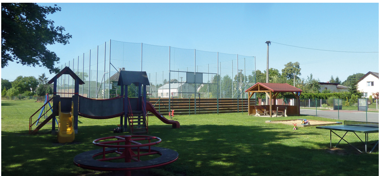
Photo 2. Leisure area in the smallest village Třebom.

Data on the income structure of households for small areas are not available in Czech statistics. There were some attempts to assess the quality of housing and household equipment, but in recent censuses, the monitoring of these categories has been abandoned. In 2011, this category was represented only by technical equipment of flats and household equipment with a personal computer with or without an Internet connection. By comparing these indicators with the national and regional levels, or with other rural regions, it is possible to very roughly estimate the state of living standards of the studied micro-region. A certain problem is that the equipment, which, at