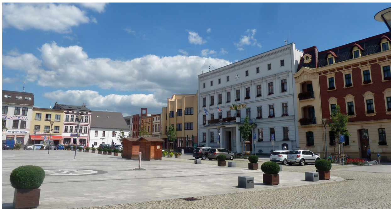
Photo 1. The centre of the Hlučín microregion has an urban character.

road I/56 Poruba – Hlučín – Dolní Benešov – Kravaře – Opava. Although the main route from Ostrava to the west is southern situated road I/11 and today also D1 motorway, the road through the Hlučín region is popularly used by truck drivers, especially in the winter, because it is flatter. Traffic intensities here reach 7,000–9,000 vehicles per day in individual sections. The transverse roads II/467 in the vicinity of Kravaře and II/469 in the vicinity of Hlučín are relatively busy (about 3,000 vehicles daily). The railway connection is provided by line 317 Opava – Hlučín, which was extended by a tram line in the years 1950–1980. There is a branch from Kravaře to Chuchelná, which was previously part of the international line Opava – Racibórz. Traffic from Chuchelná to the border was not resumed after the war.