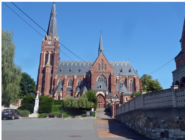
Photo 3. The church of St. John the Baptist in Sudice (1904–1906) is a scaled-down copy of the Cologne Cathedral.