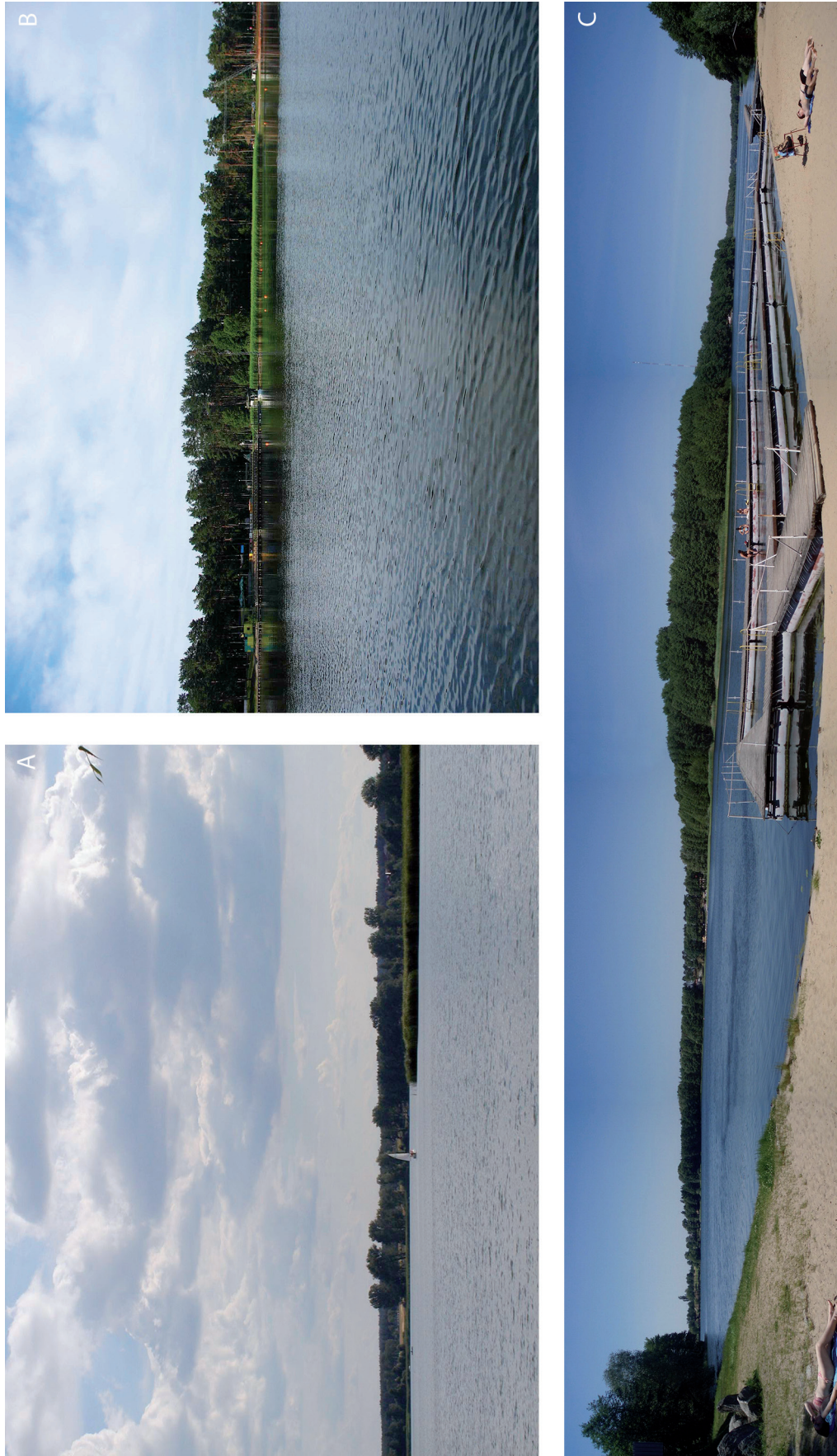
Fig. 1. Considered lakescapes: A - Lake Zbąszynskie, B - Lake Necko, C - Lake Ślesinskie (cf. Fig. 2)