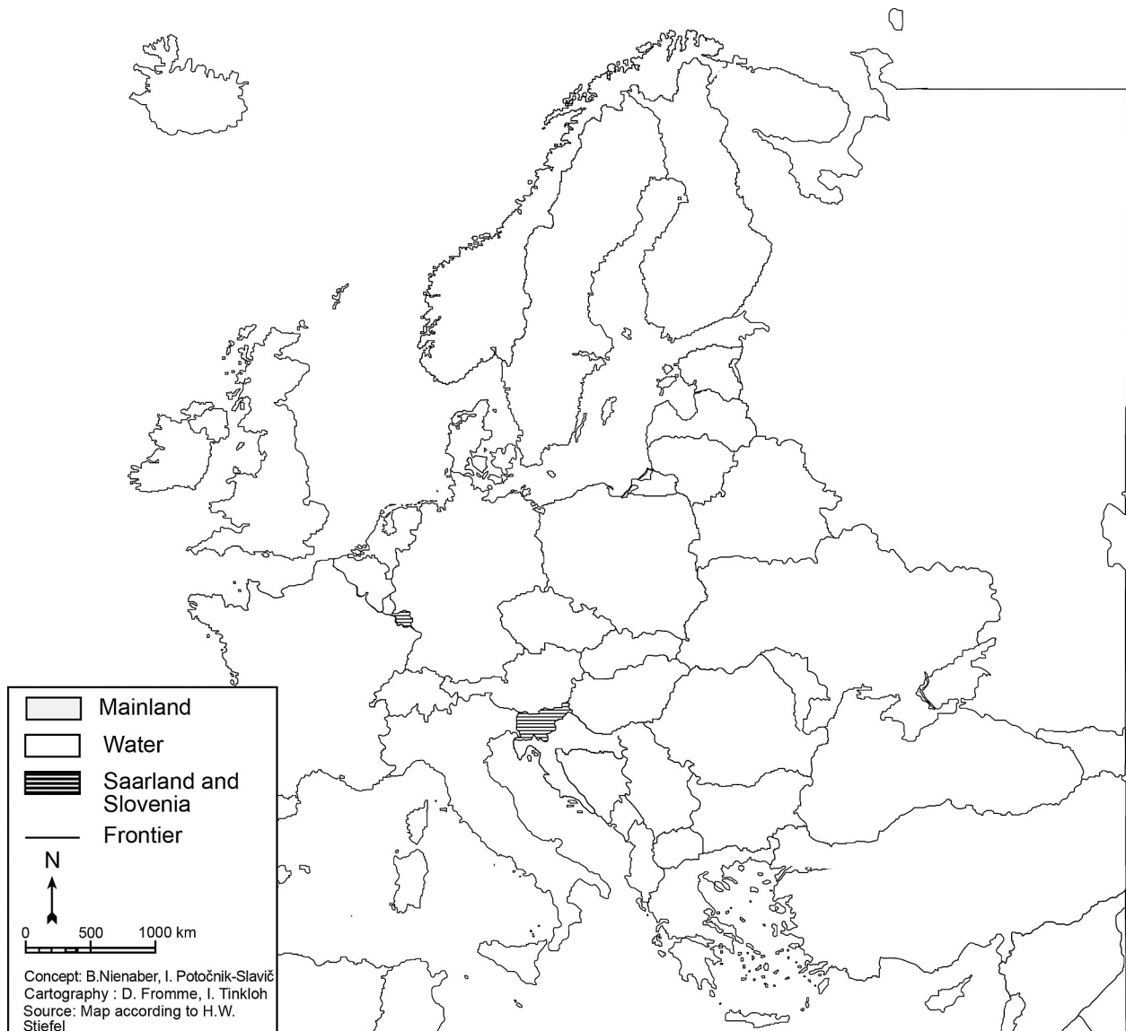
Fig. 1. Location of the case study regions: Saarland, Germany, and Slovenia.

With an area of 2,569.68 km 2 , Saarland (Fig. 1) is the smallest German federal state. Liedtke (1969: 10–11) defines its three different landscape formations: flats with monadnocks, cuesta landscapes, and valley landscapes of the Pleistocene. Geologically, Saarland is dominated by shell limestone in the south-east and west. North of these areas red sandstone can be found (Schneider 1991: map). The climate is characterised by a double transition. The region displays great var-