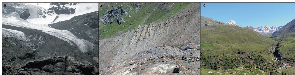
Fig. 1. Examples of moraines and activity of processes in the Forni Valley (Valtellina, Italy). a) Medial moraine of the Forni Glacier. It can be considered an active geomorphosites whose evolution is still determined by glacial processes; b) upper portion of the lateral moraine of the Forni Glacier, dating back to the Little Ice Age peak. The lateral moraine is, at present, affected by running waters, responsible for the formation of gullies, and by gravity processes, causing the fall of blocks (passive geomorphosites affected by geomorphological processes different from the genetic ones); c) moraines dating back to the Late Glacial Maximum, on the right side of the Cedec Valley, a tributary valley of the Forni Valley: they may be considered a passive geomorphosite and a relatively inactive landform (see Bisci & Dramis, 1991), belonging to a past morphoclimatic system and currently not rapidly evolving (photo by I. Bollati: 2011; 2013)

The glacial environment is a typical example of climate-depending modification of landforms and of the distinction between genetic and cur-