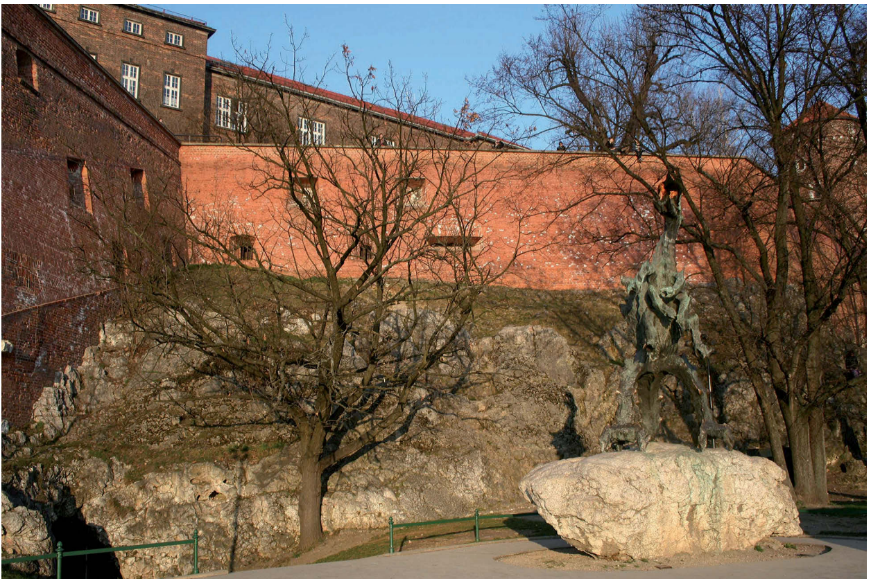
Fig. 8. Recultivated landscape - the Wawel hill breach and the Wawel Dragon