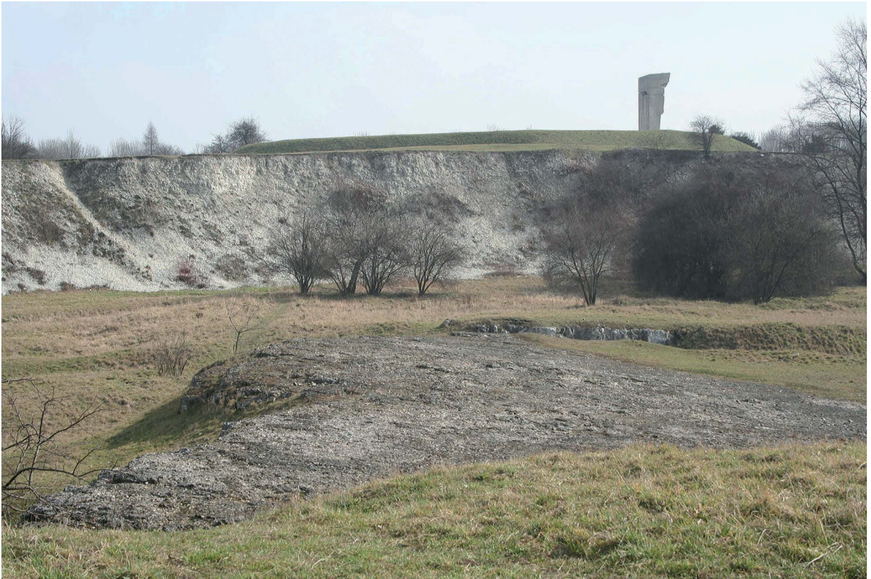
Fig. 7. Renaturalised landscape in the area of "Bonarka" quarry geological reserve