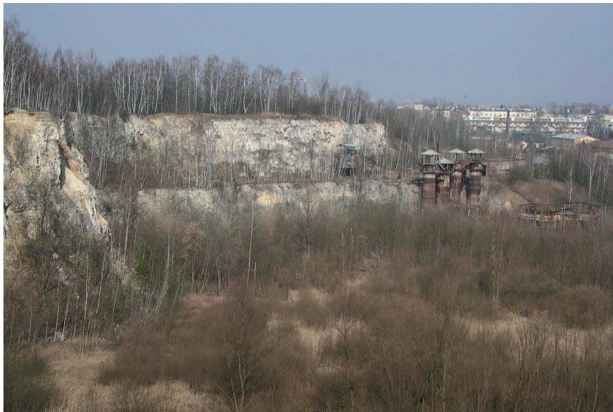
Fig. 6. Landscape in a renaturalisation process in the area in the North aspect of "Liban" quarry