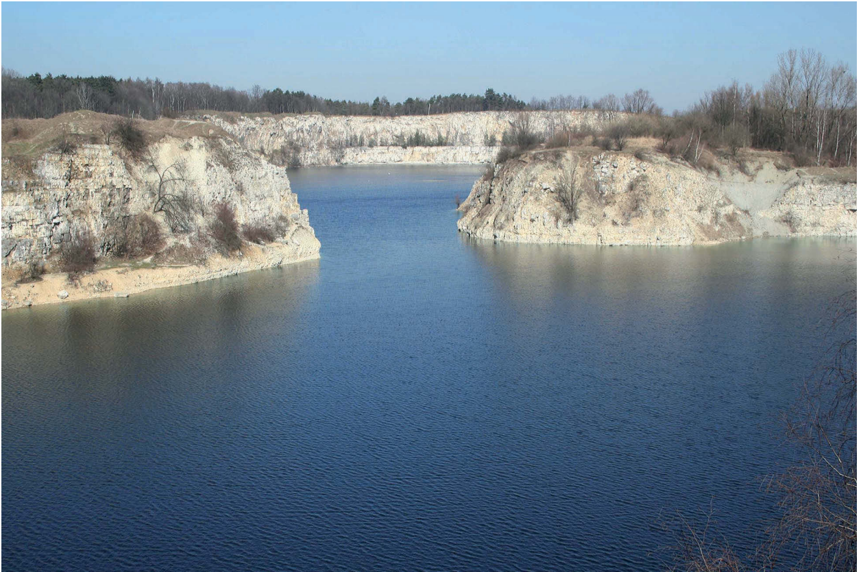
Fig. 3. Renaturalised landscape in the area of Zakrzówek Lake