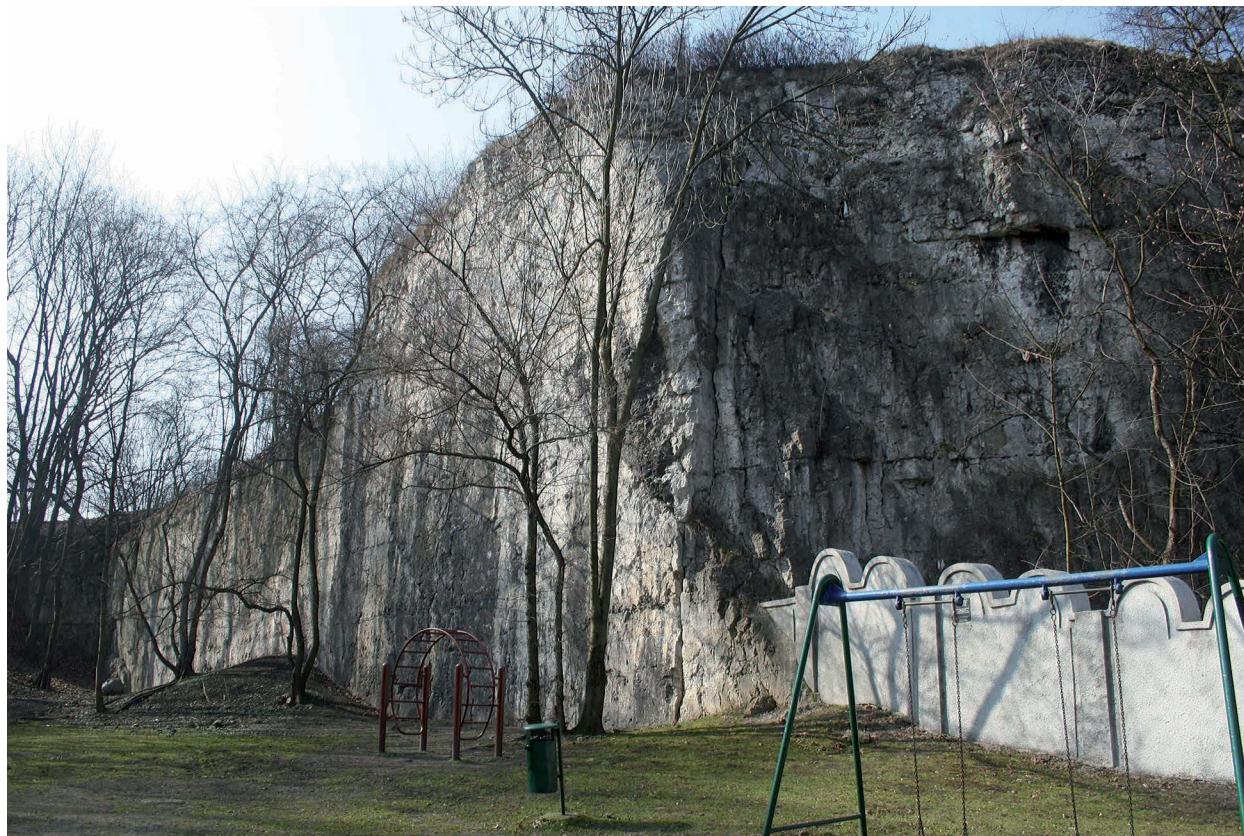
Fig. 10. Recultivated landscape in the area of "Pod Św. Benedykttem" quarry