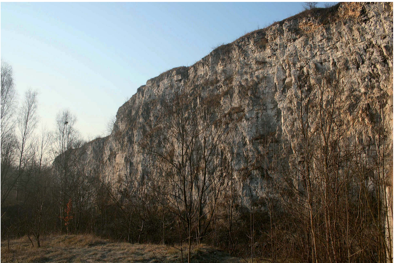
Fig. 4. Renaturalised landscape in the area of "Skalki Twardowskiego" quarry