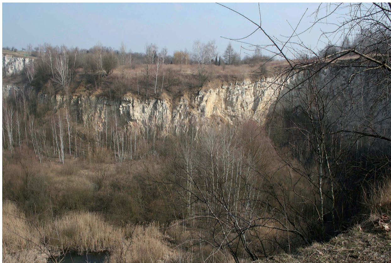
Fig. 5. Renaturalised landscape in the area in the South aspect of "Liban" quarry