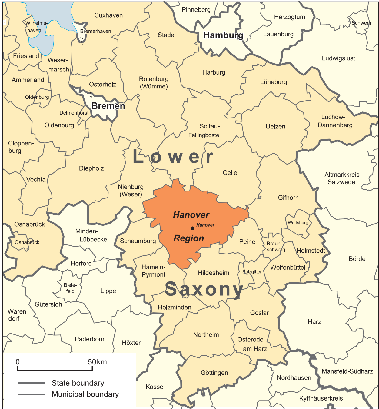
Fig. 1. Location of the Hanover region.