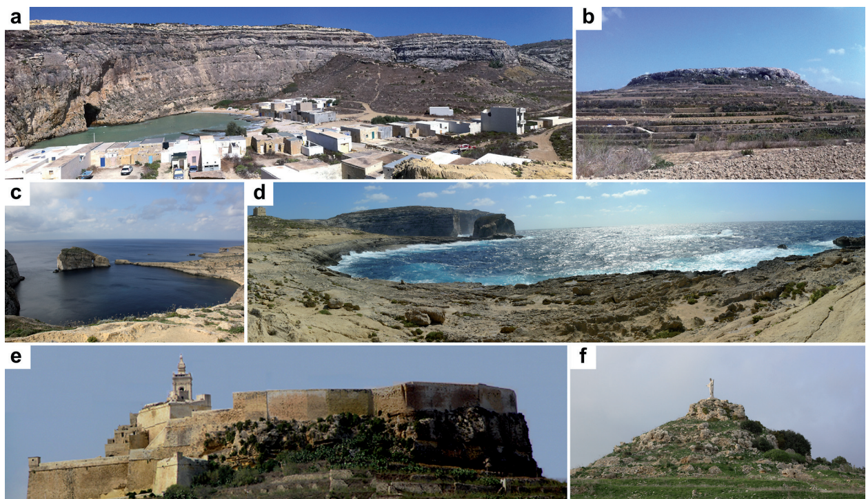
Fig. 3. Images of the sinkholes assessed as geomorphosites: a - Qawra (ID 8), b - Ghajn Abdul (ID 7), c - Dwejra Bay (ID 15), d - Dwejra North (ID 14), e - The Citadel (ID 6), f - Tas-Salvatur (ID 5).

Ghajn Abdul (Fig. 1, ID 7; Fig. 3b) is another sinkhole showing positive relief. It is a large calcareous mesa emerging from the surrounding clays. Its scientific value is due to the presence of a well-exposed sedimentary infill. Ghajn Abdul also shows a high historical value: it is thought that the people who first colonised Gozo in the Neolithic period lived in caves on Ghajn Abdul plateau.